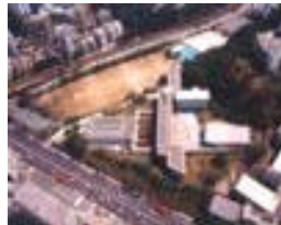
(The site is on the NE corner where the tennis courts, cement grounds and swimming pool are located.)

Fr. George Zee writes, “The application for changing the lease of the land on Sept. 22nd 2000 was rejected because: