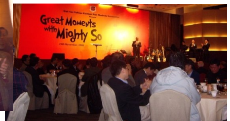
Mighty So's party