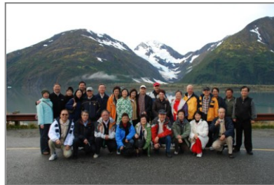
WYK65ers group photo