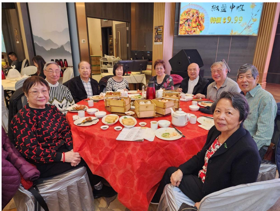
2023-04-28- Toronto- Lunch Gathering