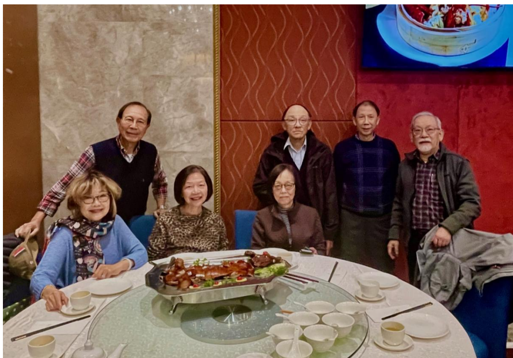
2023-10-20-Vancouver Gathering (Photo 2)