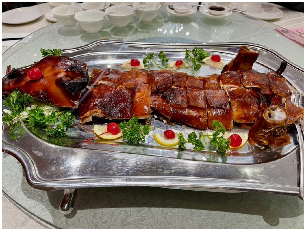
2023-10-20-Vancouver Gathering (Photo 1)

The Vancouver get-together was enjoyed and welcomed by all of us as we savoured the good company, good chat and good food.