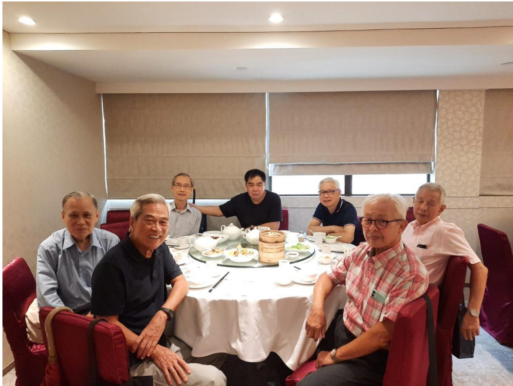
2022-09-29-Hong Kong Reunion Lunch Meeting