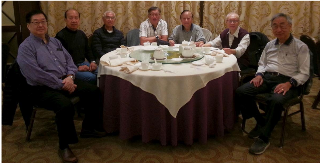
2019-10-02-Toronto- Dinner Gathering