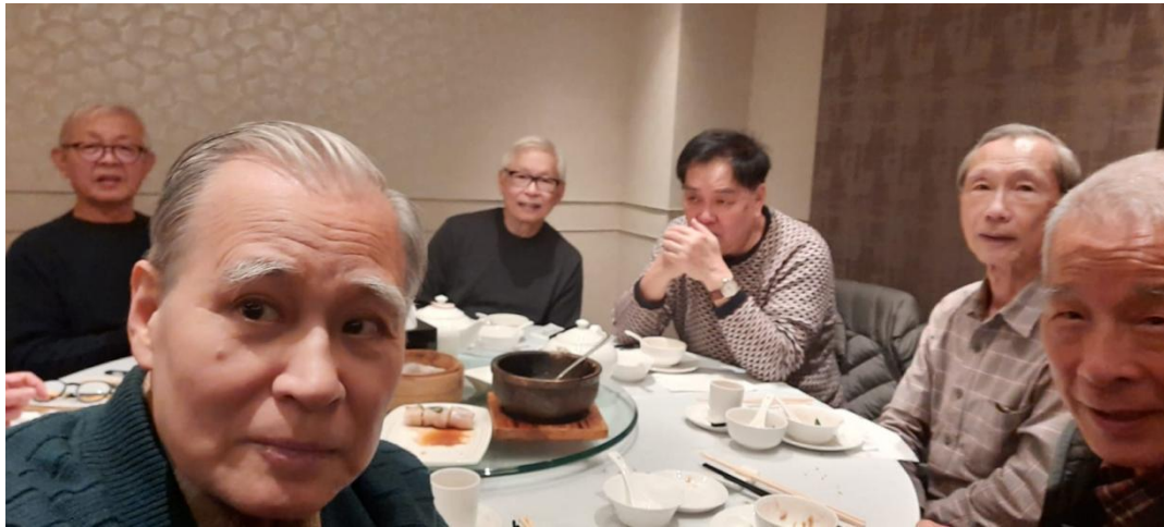
2022-12-20-Hong Kong Reunion Lunch Meeting