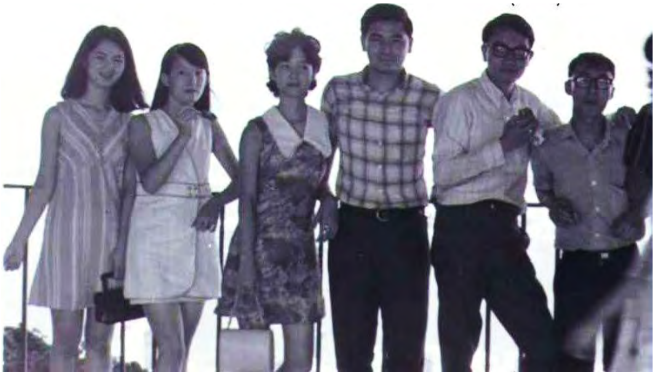
1987 - Hong Kong - 26 th Anniversary Reunion