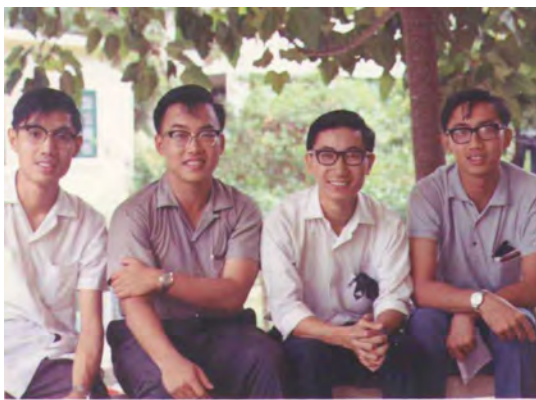
61 grads reunion - summer 66