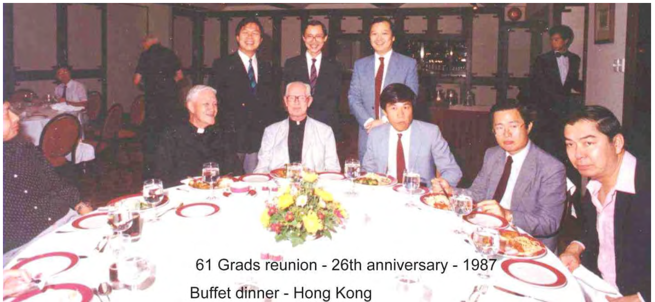
61 Grads reunion - 26th anniversary - 1987 Buffet dinner - Hong Kong