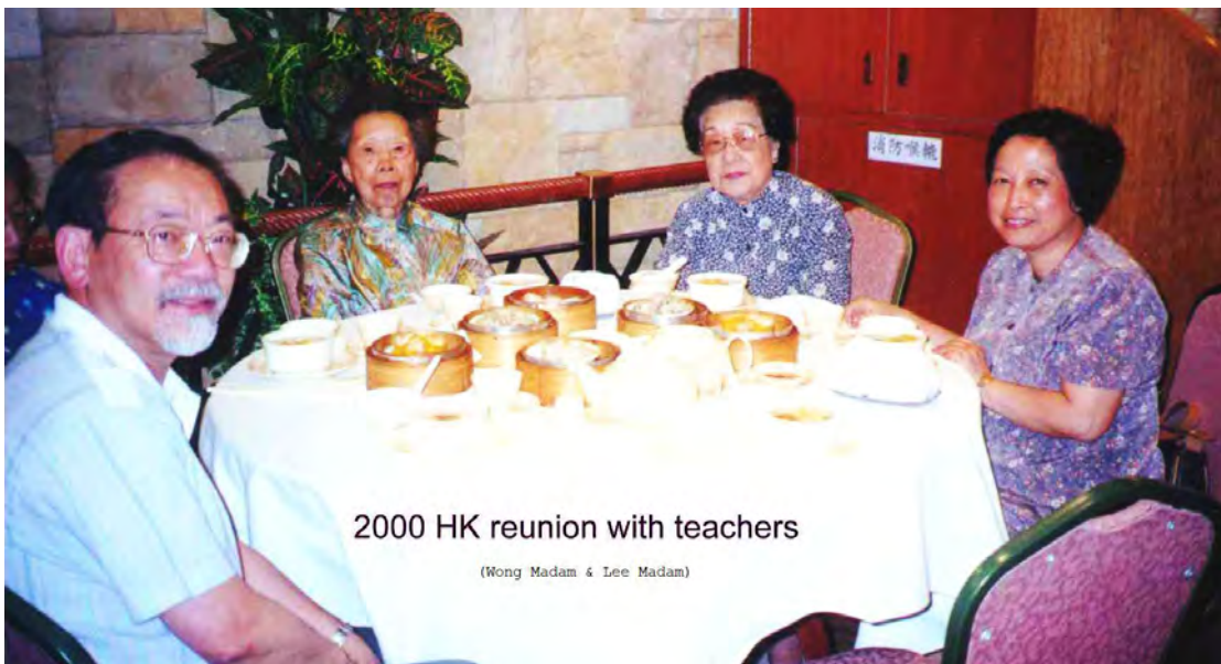
2000 HK reunion with teachers