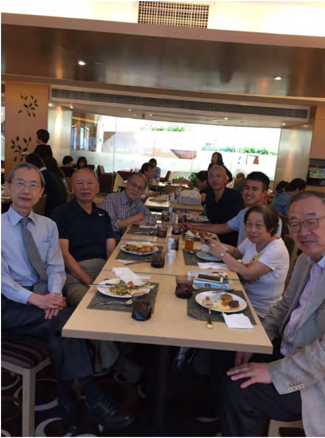
2018 (Aug) - Hong Kong Reunion