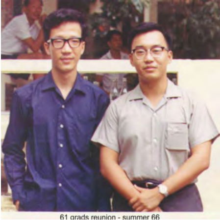
61 grads reunion - summer 66