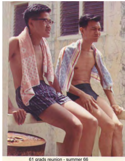
61 grads reunion - summer 66