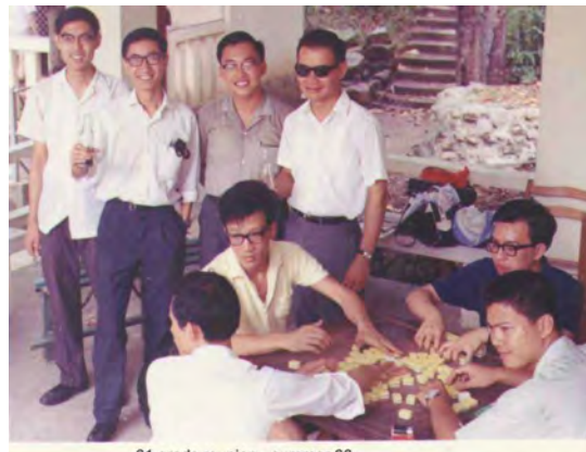
61 grade reunion - summer 66