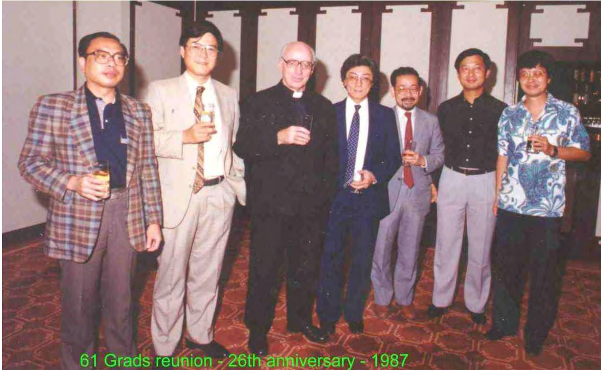
61 Grads reunion - 26th anniversary - 1987