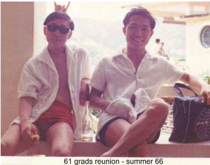
61 grads reunion - summer 66