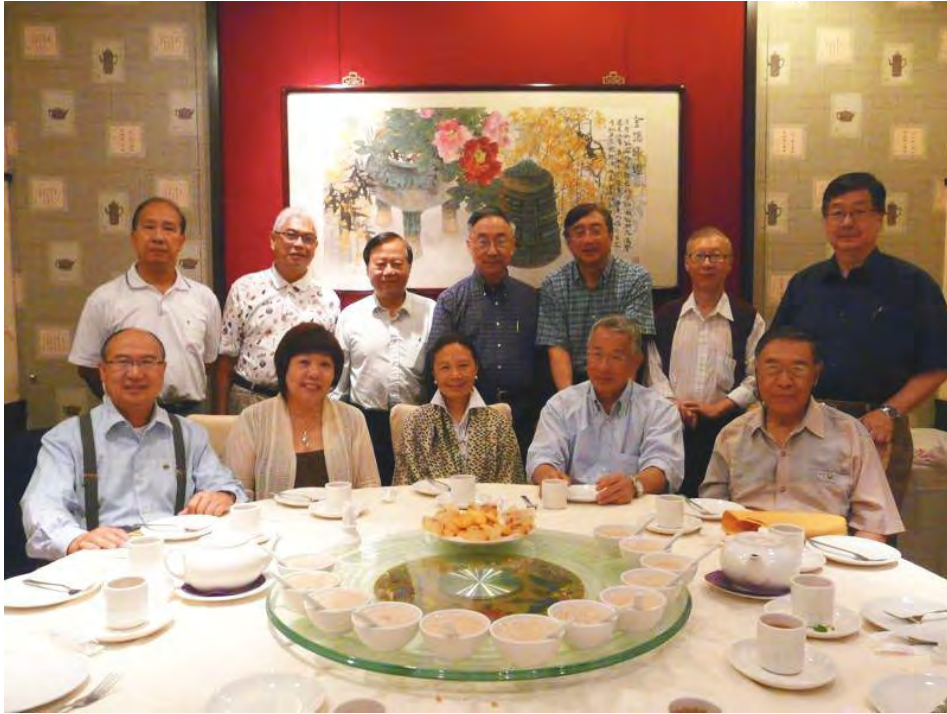
2010 (Aug) International Conference - Los Angeles Reunion (visitors: too many to list here)