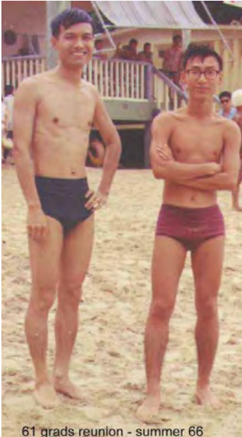
61 grads reunion - summer 66