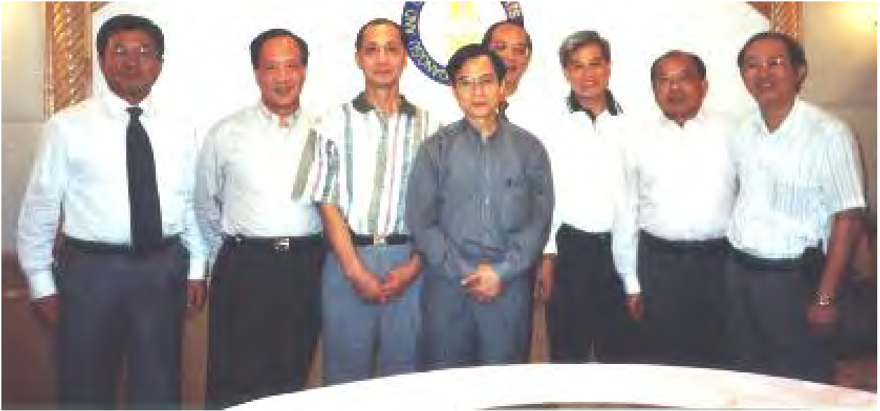
2001 (Dec) - Hong Kong Reunion (visitor: Martin Lee)