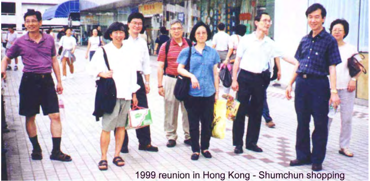
1999 reunion in Hong Kong - Shumchun shopping