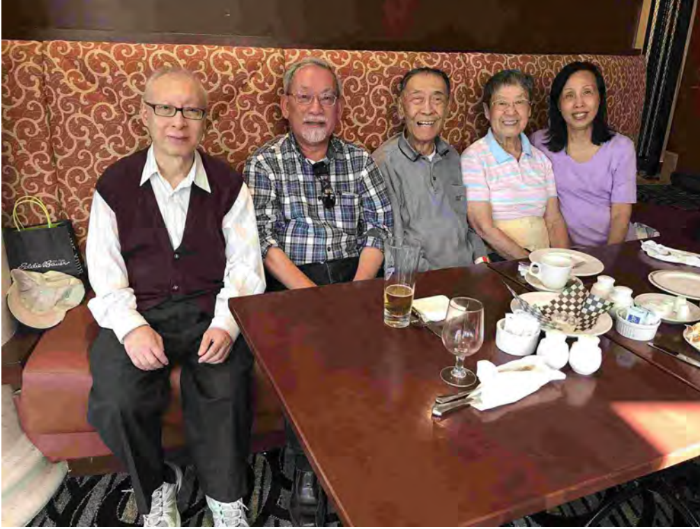
C. At the Terry Fox Run (Sep 16)