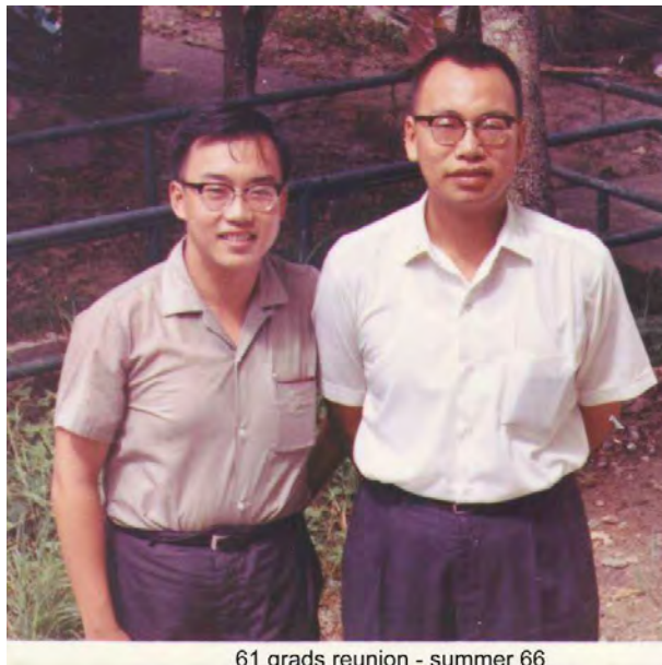
61 grads reunion - summer 66