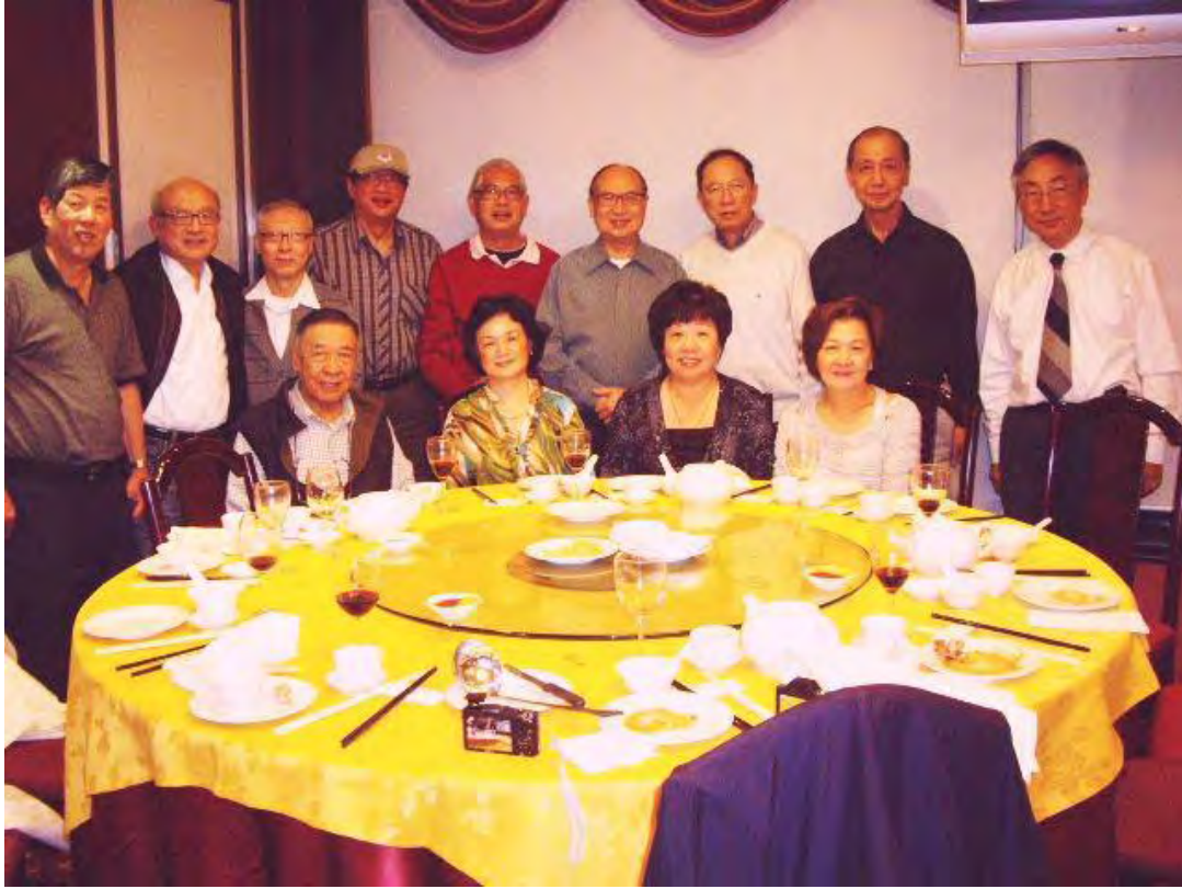
2012 (Nov) - Hong Kong Reunion (visitor: Ho Sir)