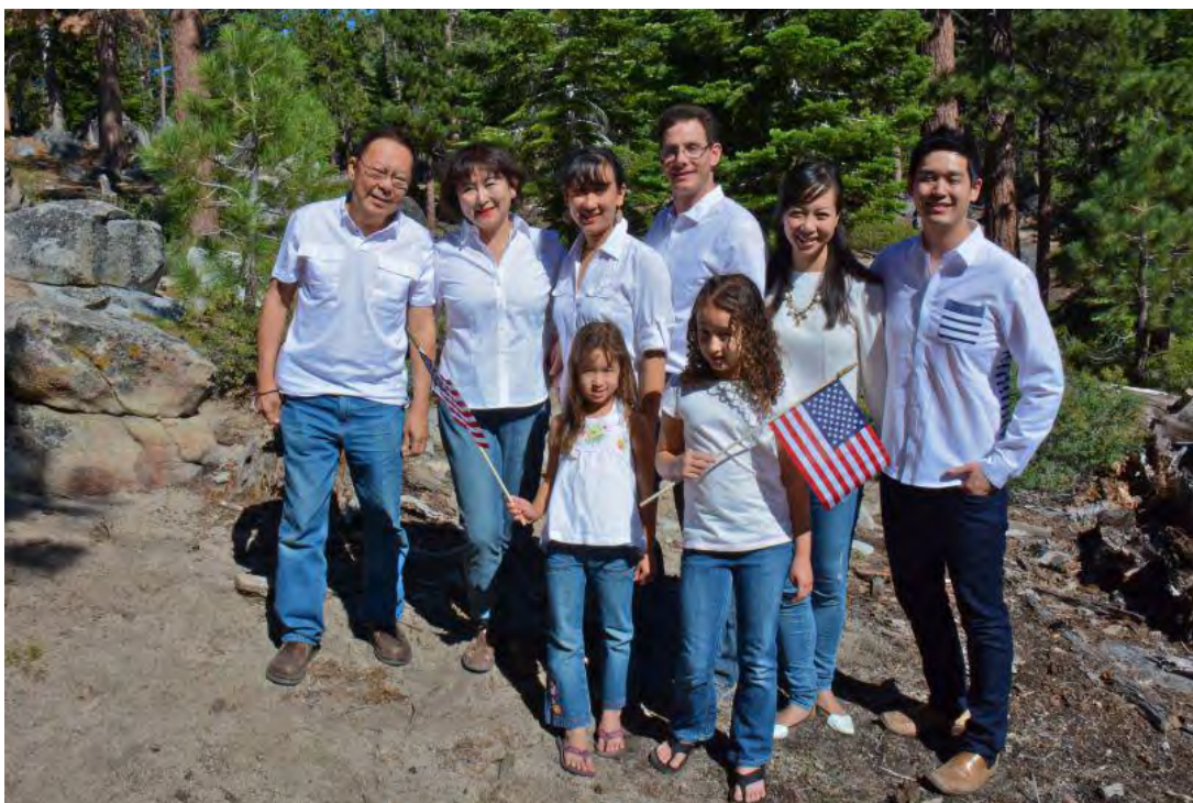
2014-07-06-Reunion Week at Lake Tahoe