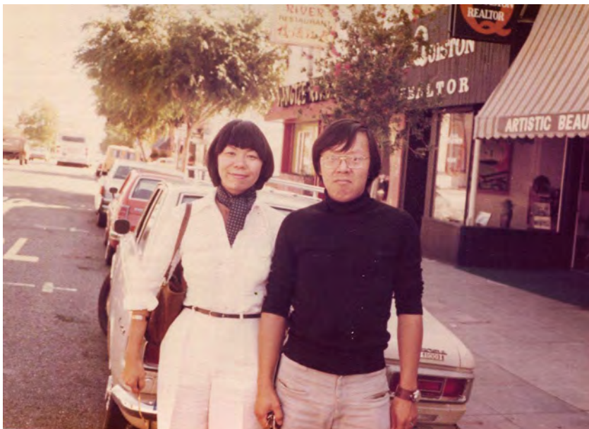
1970s late-Olivia, Hin-Nang (dramatic face)