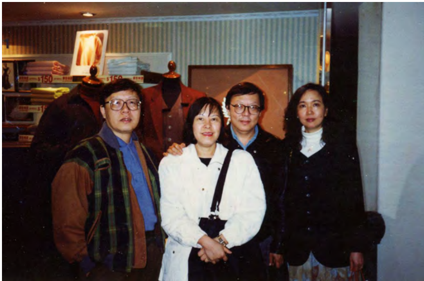
1992-Nang's Visit-Hin-Kong, Ho-Yin, Hin-Nang, Mei