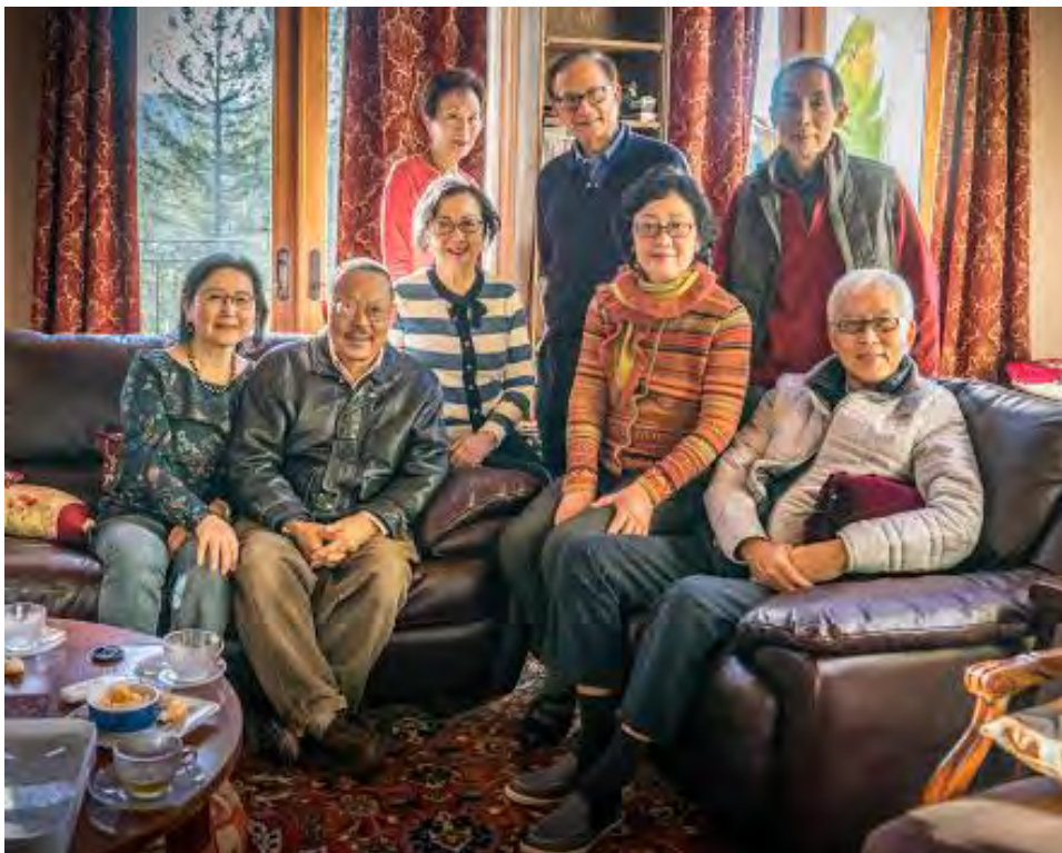
2017 Jan-WYK Classmates' Visit