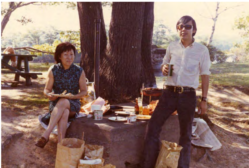
1970s-Family BBQ Picnic