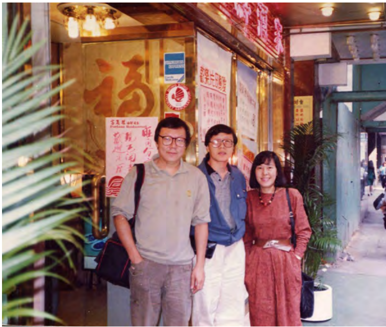
1990s early-Nang's Visit-Hin-Nang, Hin-Kong, Ho-Yin