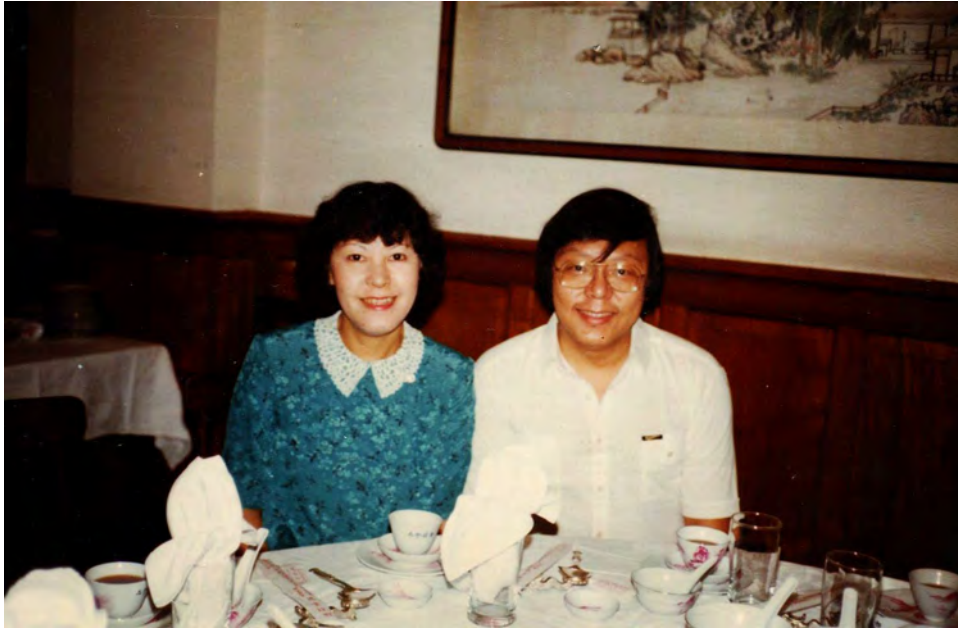
1982-Nang's Visit-Ho-Yin, Hin-Nang