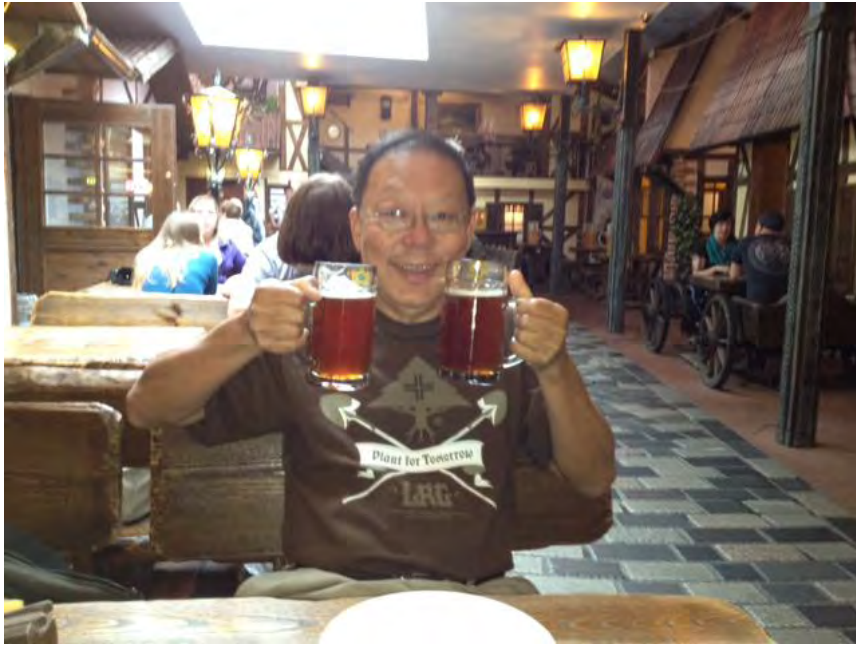
2012-07-16-At an Austrian Beer Festival Restaurant