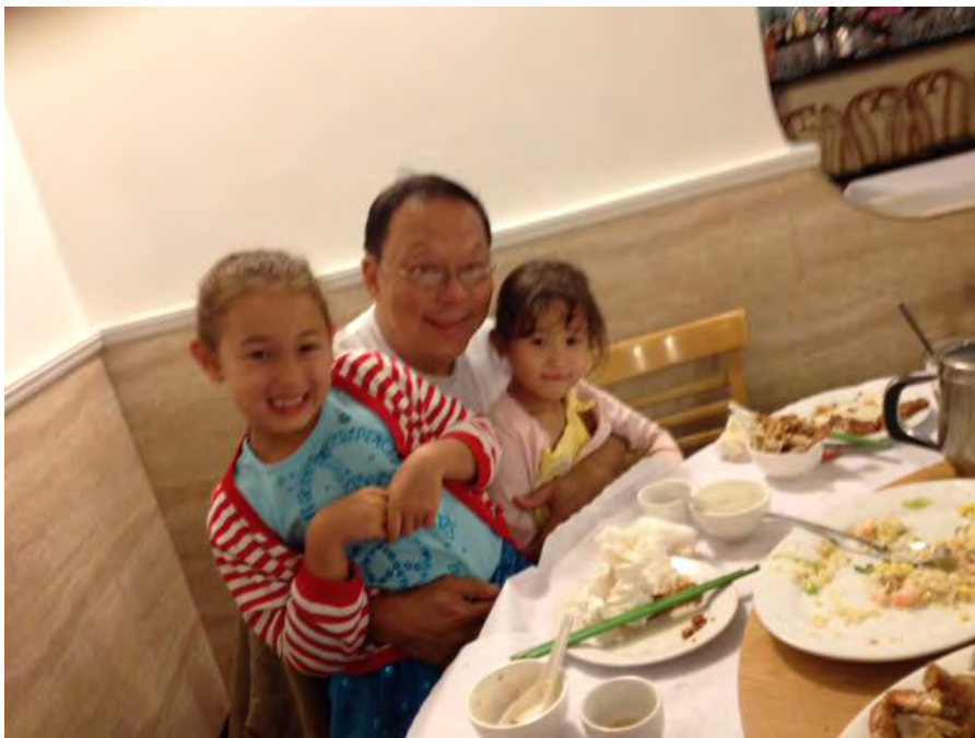
2012-07-24-Seafood Banquet with Granddaughters