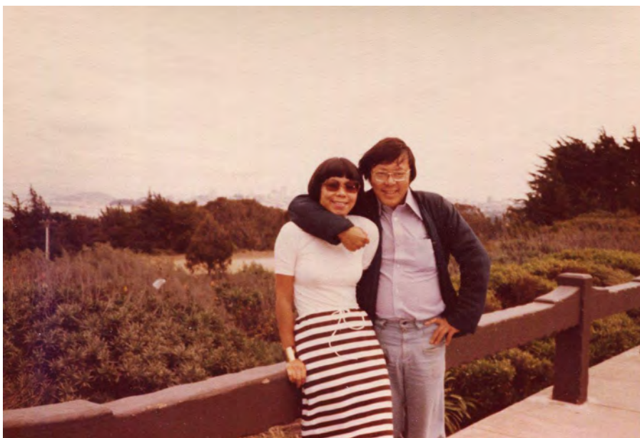
1970s late-Ho-Yin's Visit-Olivia, Hin-Nang