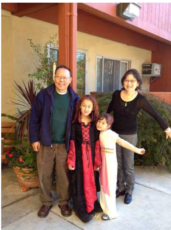
2013-11-01-Clan Gathering in San Francisco-with Granddaughters