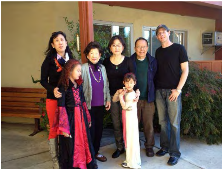
2013-11-01-Clan Gathering in San Francisco