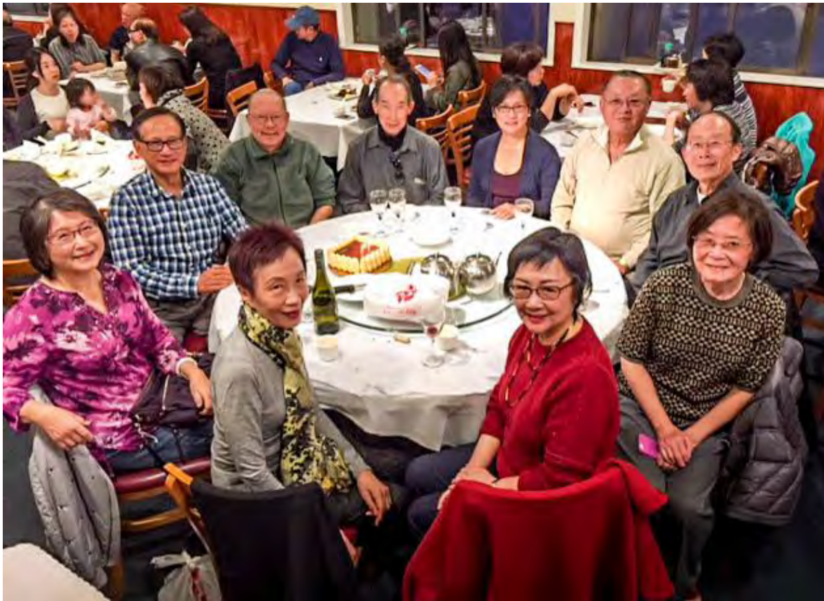
2017-10-21-WYK Classmates' Gathering-Dinner at Won Kok