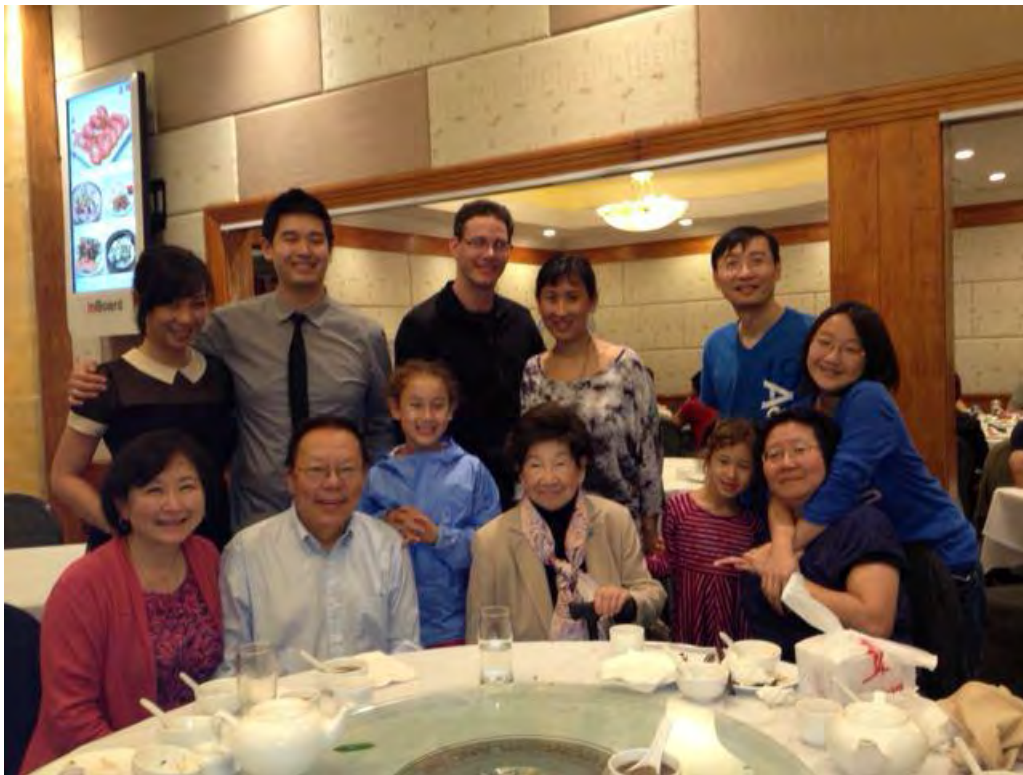
2013-09-29-20 th Wedding Anniversary Celebration