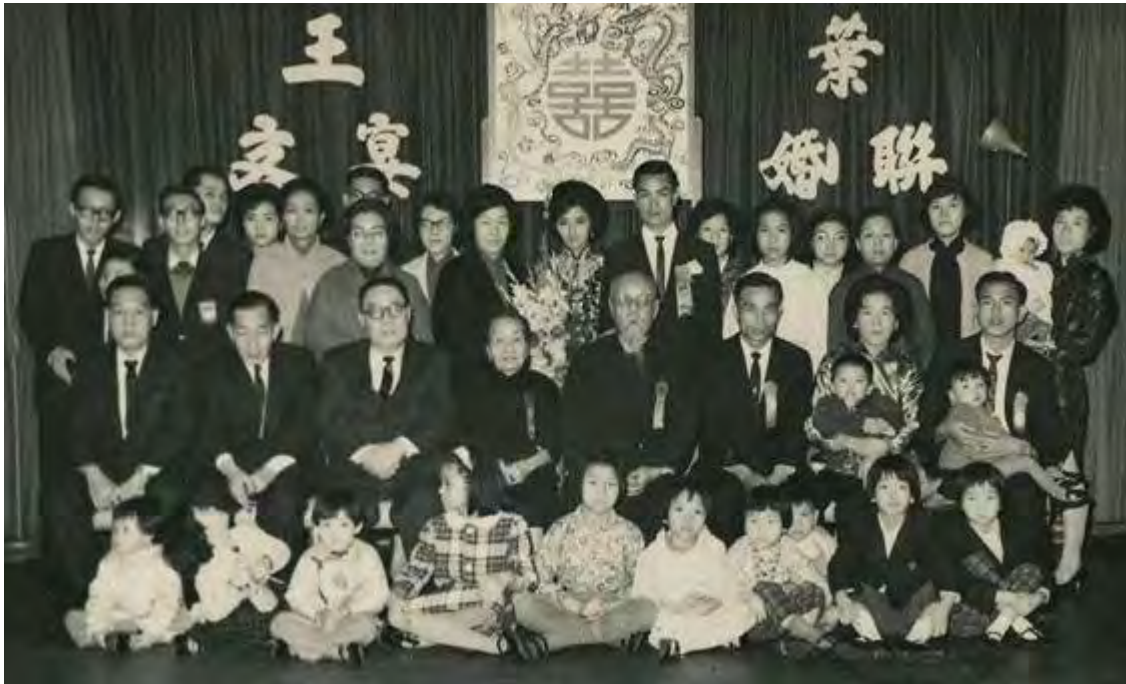
1968-At Auntie # 8's Wedding (Top row, 1 st left)