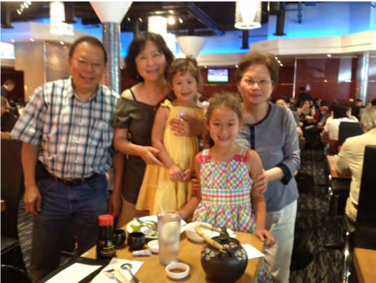
2012-06-19-Father's Day Celebration