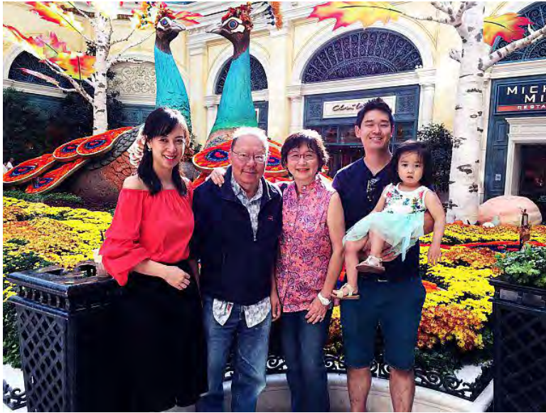
2017 September-24th Wedding Anniversary