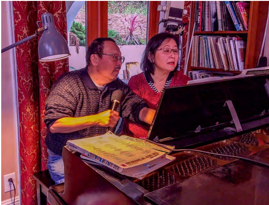
2017 Jan-WYK Classmates' Visit