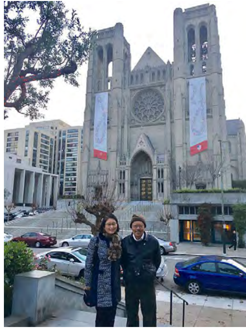
2016-12-12-At the San Francisco Grace Cathedral