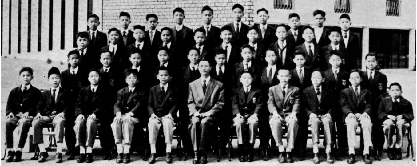
F1D, 1955-1956 (Seated, 3 rd right)