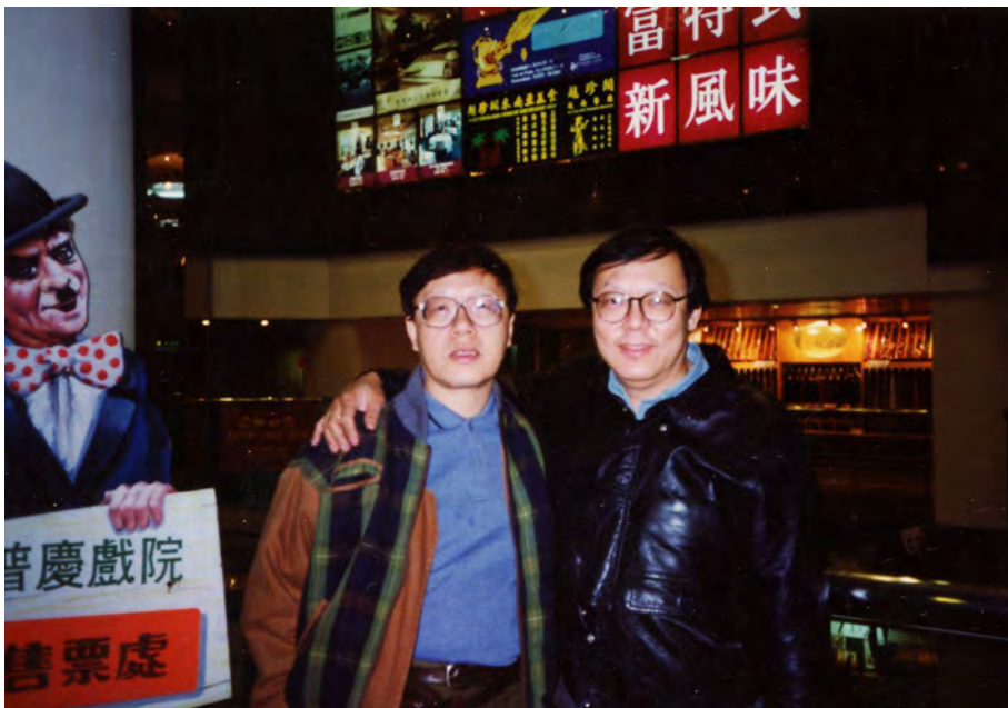
1992-Nang's Visit-Hin-Kong, Hin-Nang