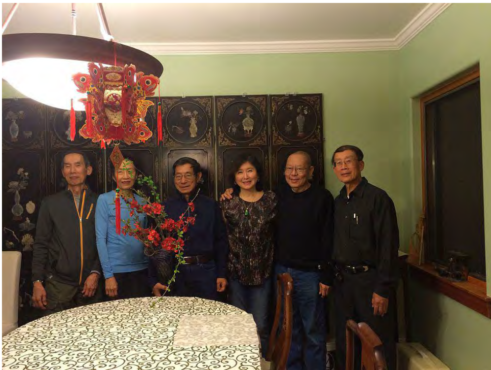
2016-04-01-With WYK Friends