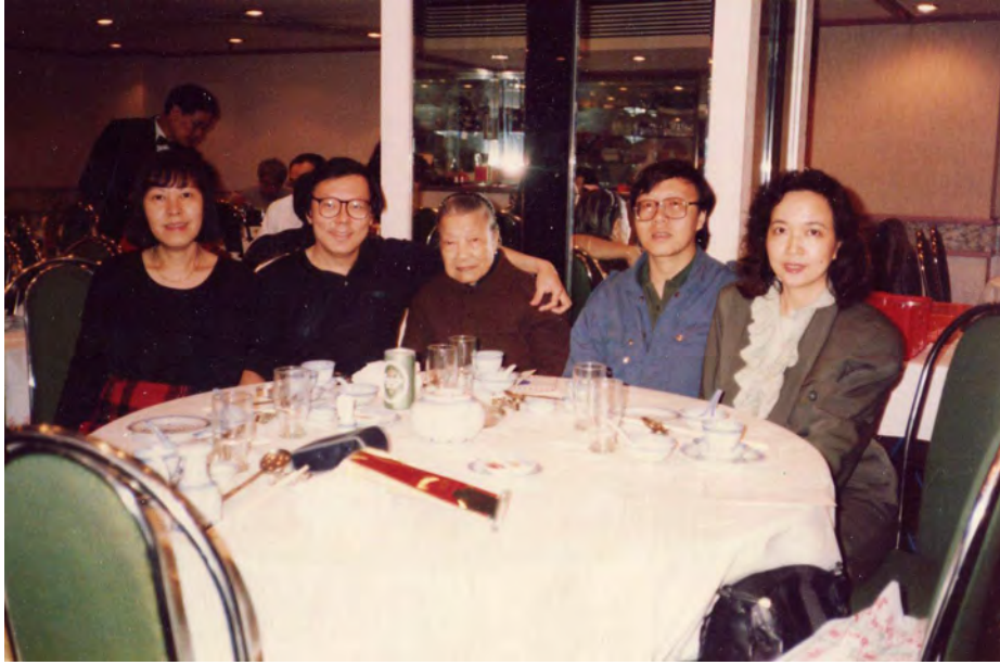
1980s late-Nang's Visit-Ho-Yin, Hin-Nang, 青姐, Hin-Kong, Mei