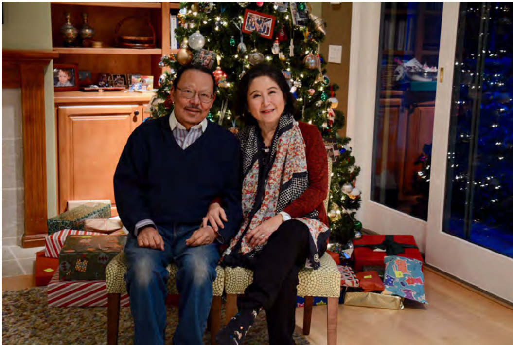
2016-12-27-Xmas & New Year Greetings