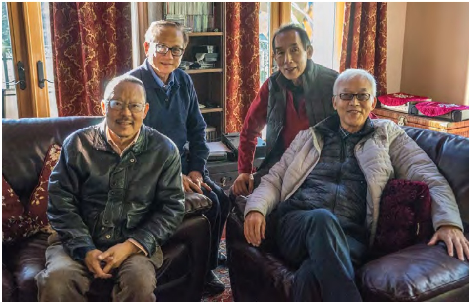
2017 Jan-WYK Classmates' Visit