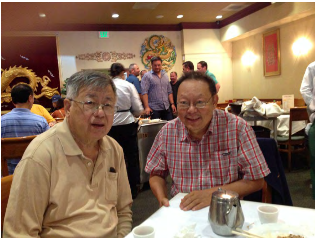
2015-08-29-With WYK Classmate from HK