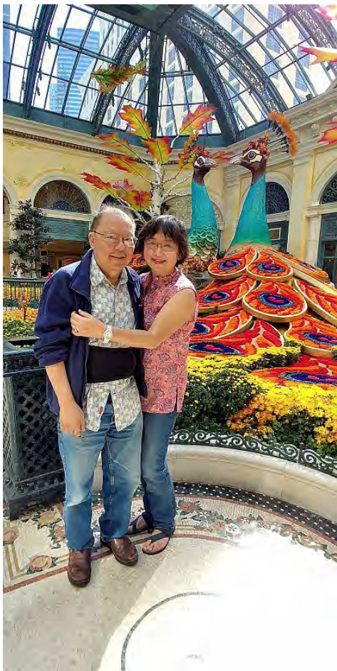
2017 September-24th Wedding Anniversary