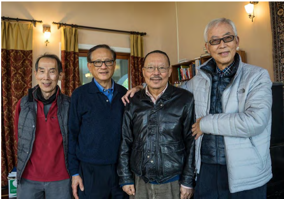
2017 Jan-WYK Classmates' Visit