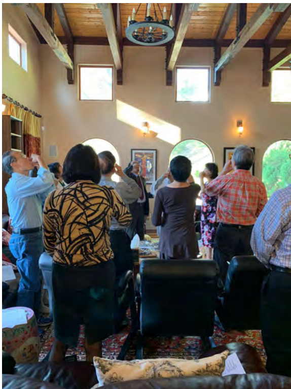
2018-11-06-Friends Taking Communion Wine