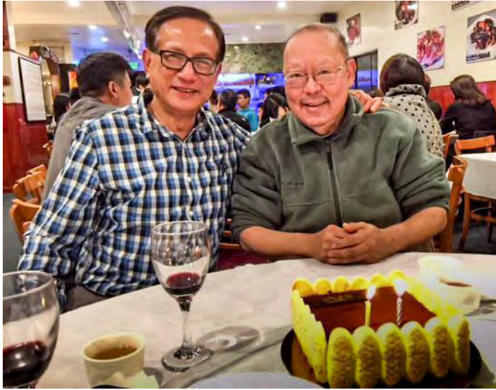
2017-10-21-WYK Classmates' Gathering-Dinner at Won Kok