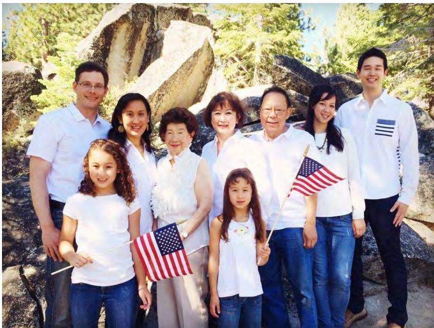
2014-07-04-Celebrating July 4