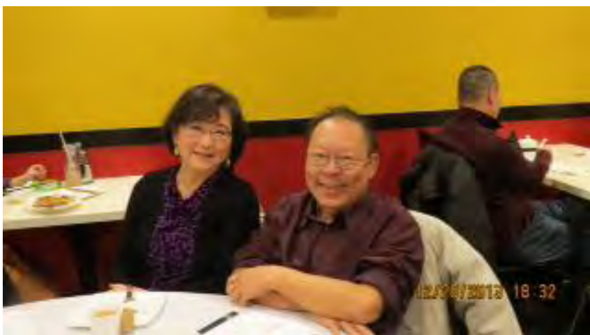
2014-03-20-Celebrating Absence of Cancerous Tumor from Catscan