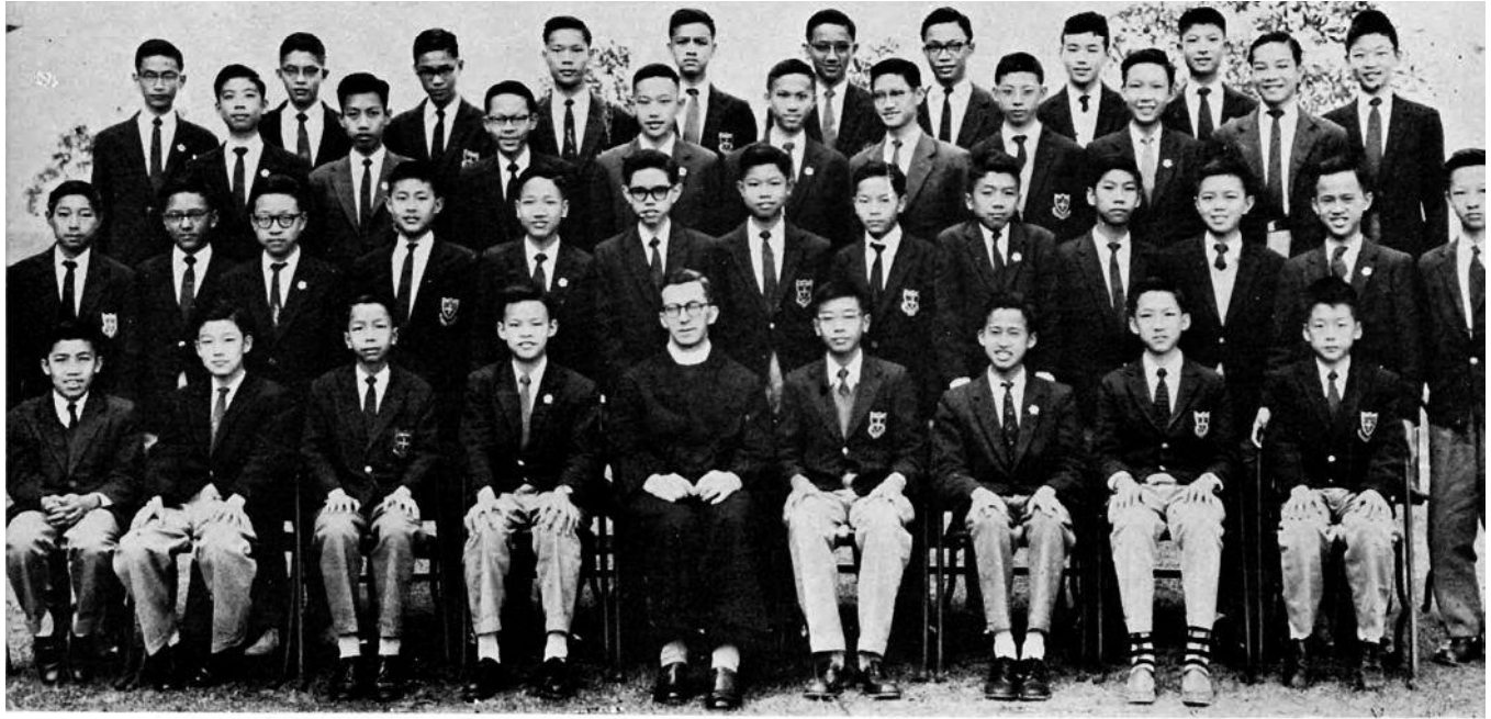
FORM III D.

F3D, 1957-1958 (2 nd row from top, 3 rd left)