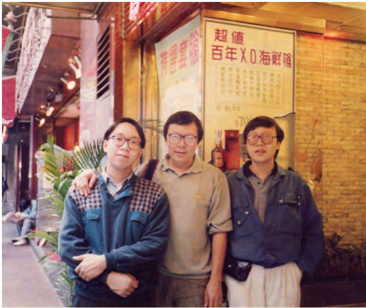
1990s early-Nang's Visit-Yat-Sin, Hin-Nang, Hin-Kong