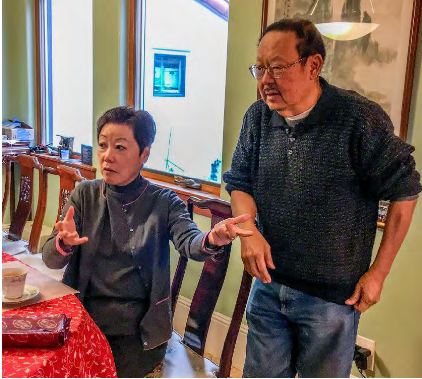
2017 Jan-WYK Classmates' Visit