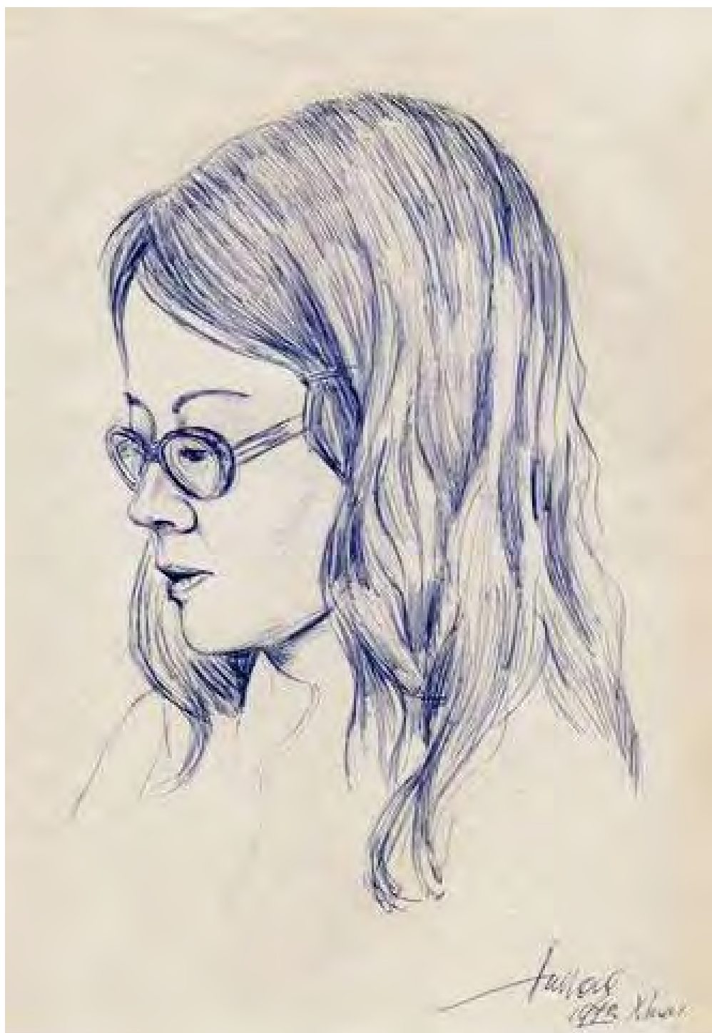
1972 sketch of Ho-Kok by Hin-Nang