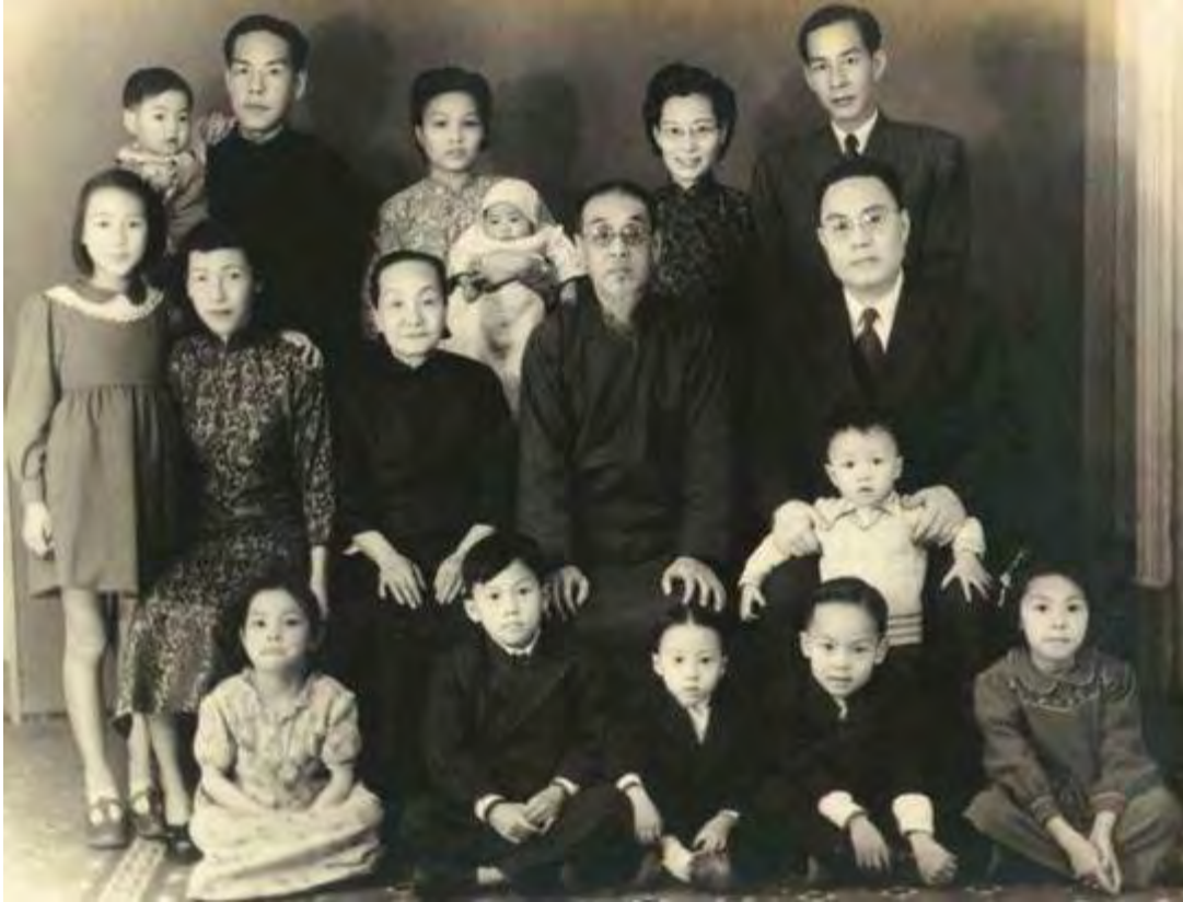
1950-One Big Family-Seated, 2 nd right