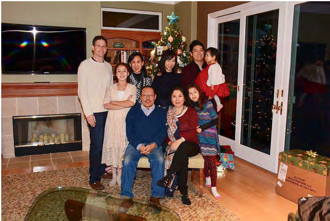
2016-12-27-Xmas & New Year Greetings