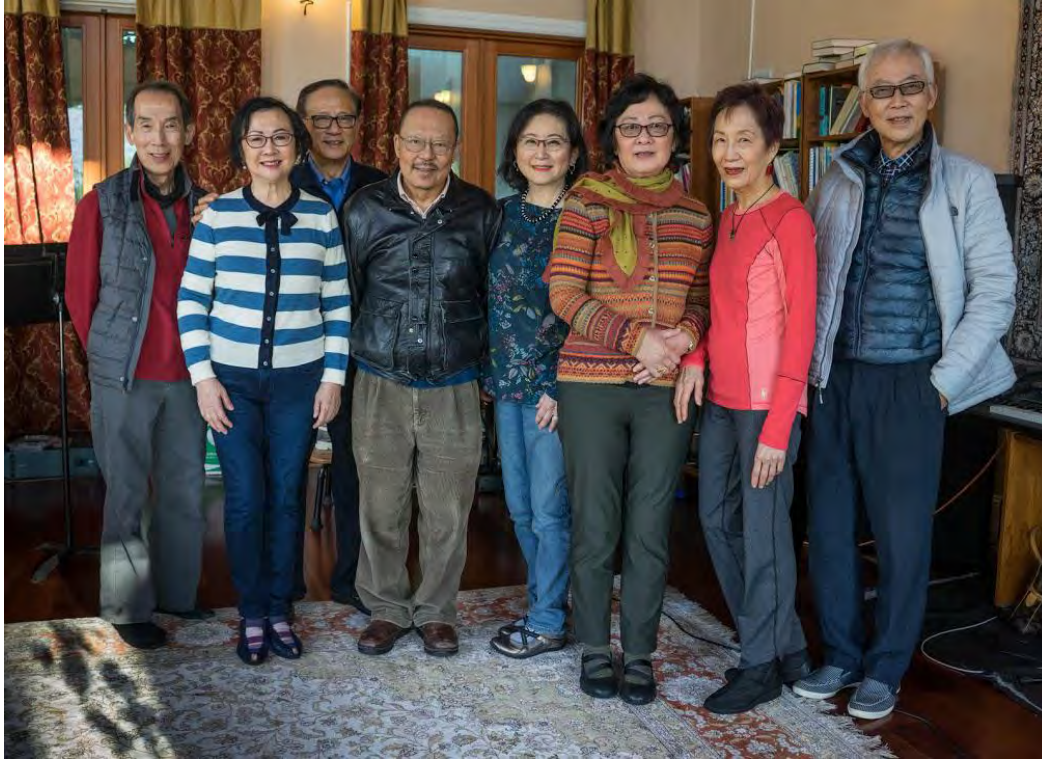
2017 Jan-WYK Classmates' Visit