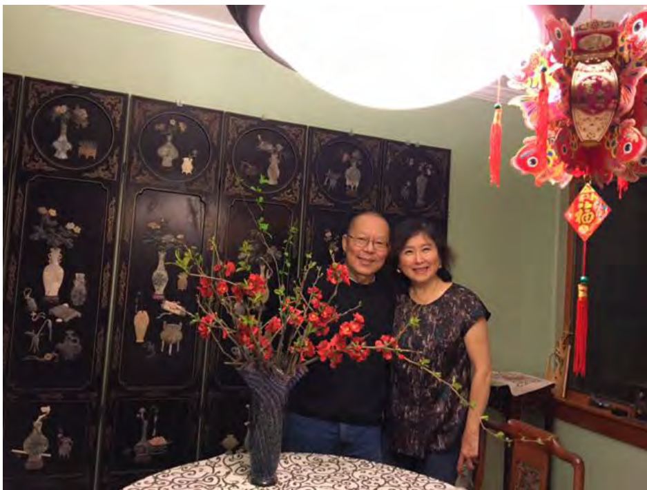
2016-Happy Chinese New Year