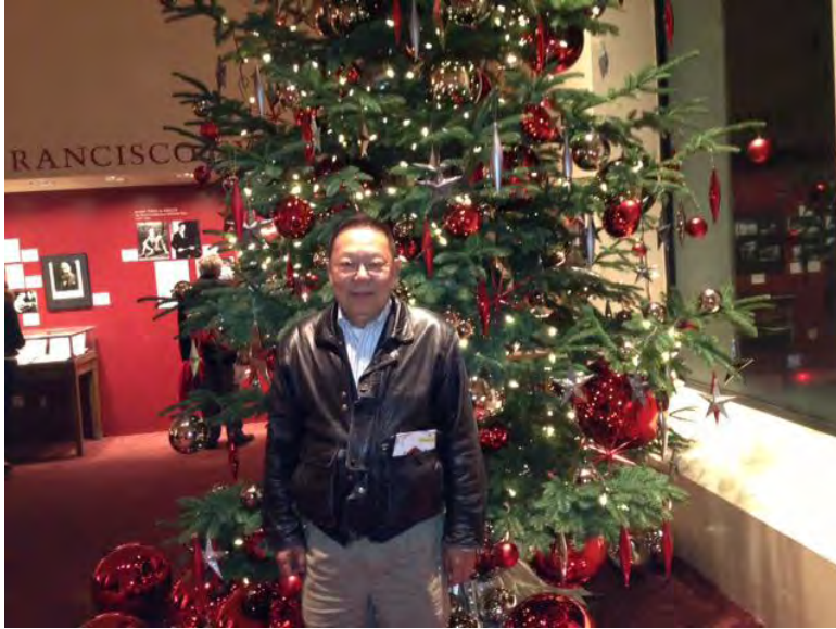
2012-12-23-San Francisco Symphony Hall Xmas Greetings