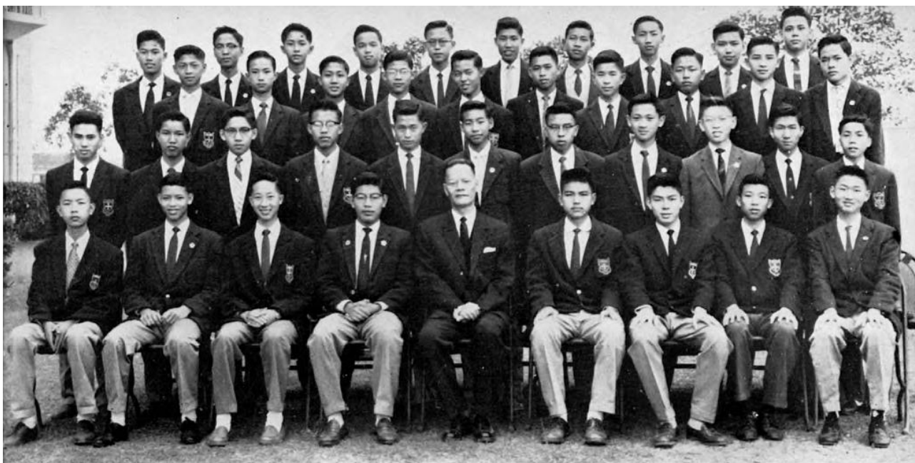
FORM II A.

F2A, 1957-1958 – 2nd row from top – 2 nd left