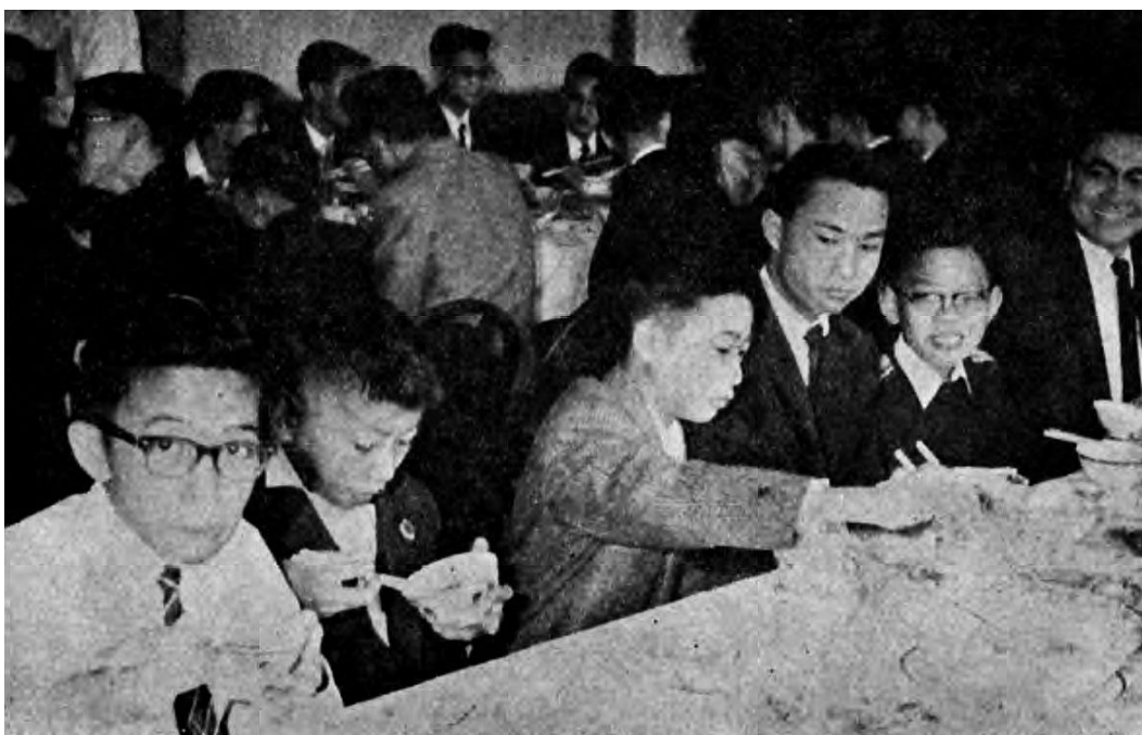
At the after-Baptism breakfast.

1960 As Godfather to Schoolmate – 3rd row from top, 4 th right