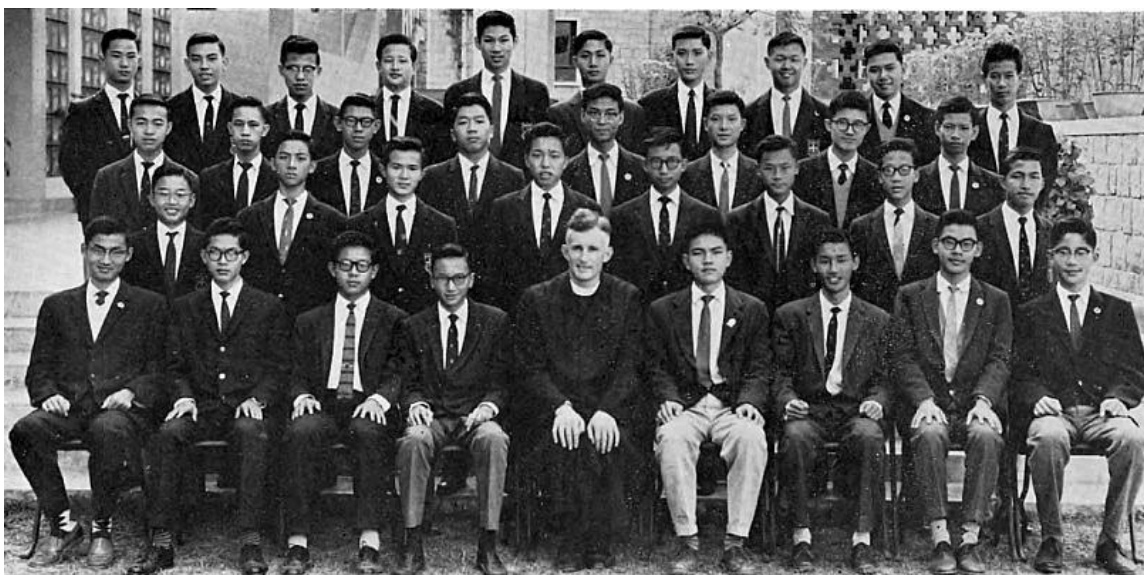
FORM 4B (59-60)