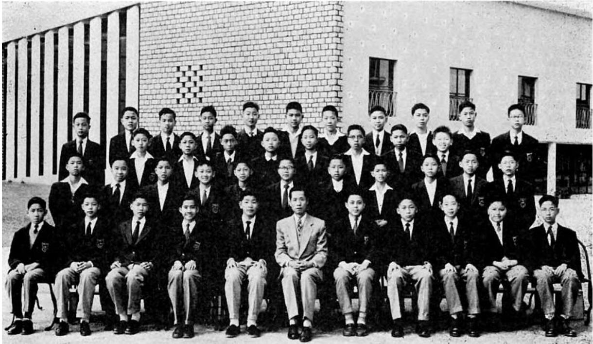
P6A, 1955-1956 – 2nd row from top – 4th right