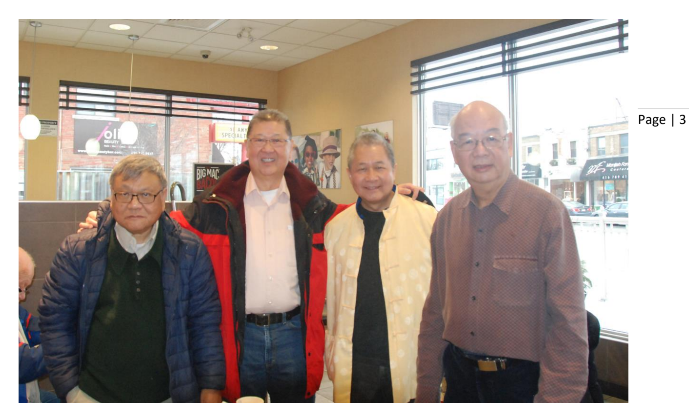
photo 9 - at McDonald's, 1890 Avenue Road, Toronto, after discussion.