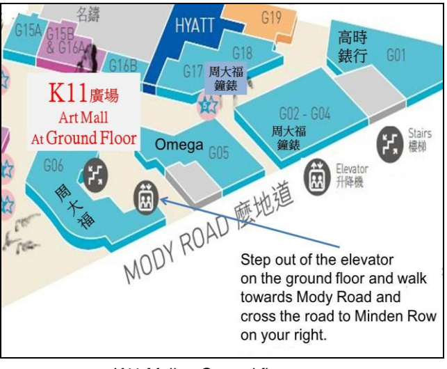
K11 Mall at Ground floor map