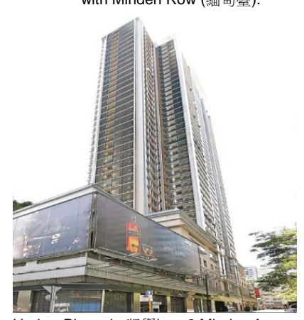
Harbor Pinnacle(凱譽) on 8 Minden Avenue