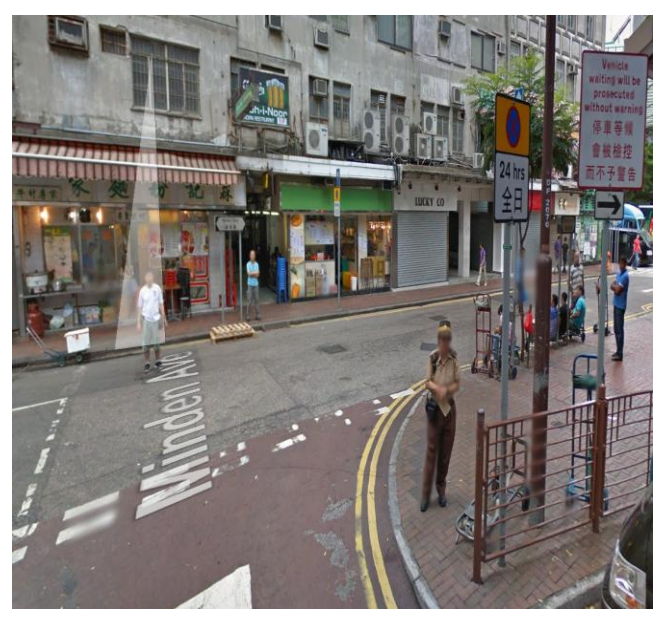
Minden Row(緬甸臺). turns into Minden Ave(棉登徑)