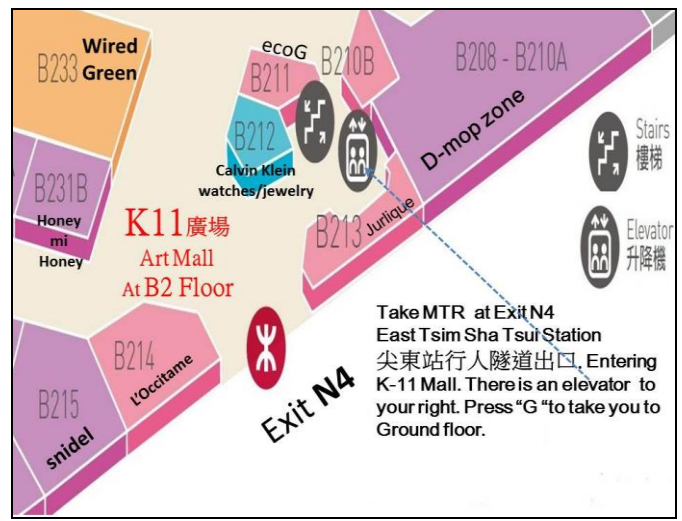
MTR Exit N4 underground entering K11 Mall at B2 Floor