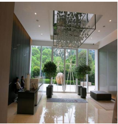
Podium Lobby reception, Club house door entrance on the left