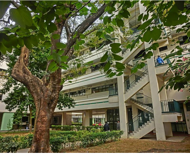
*** End of Event B ***