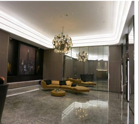
Entrance Lobby, elevator to your right Press "P" to the Podium floor