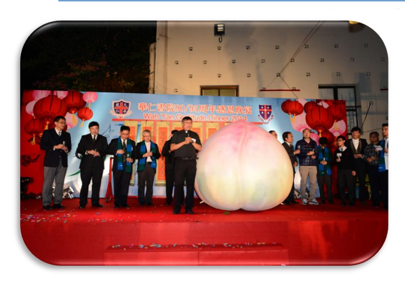
A birthday bun model was made to celebrate both Wah Yans' birthdays.