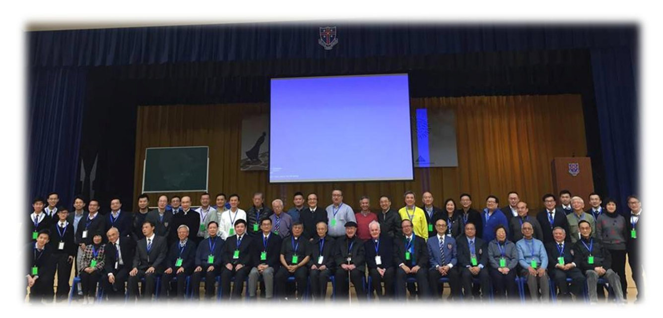
Day 1- Reception at Wah Yan College, Hong Kong

The 2014 Wah Yan International Conference was held in a distinguish way this year, with a three-day event spanned across three locations instead of one single venue. The Conference set its reception in the newly renovated school hall of WYHK on 5<sup>th</sup> December with day trips to Jesuits establishments in Macau & Yim Tin Tsai on 6<sup>th</sup> & 7<sup>th</sup> respectively.