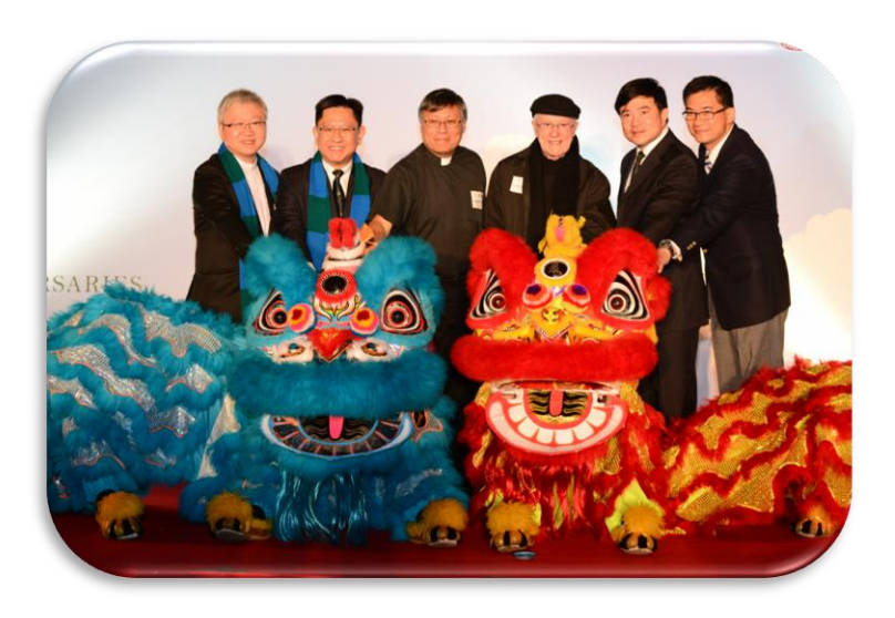
The dinner was kicked off with lion dance performance.