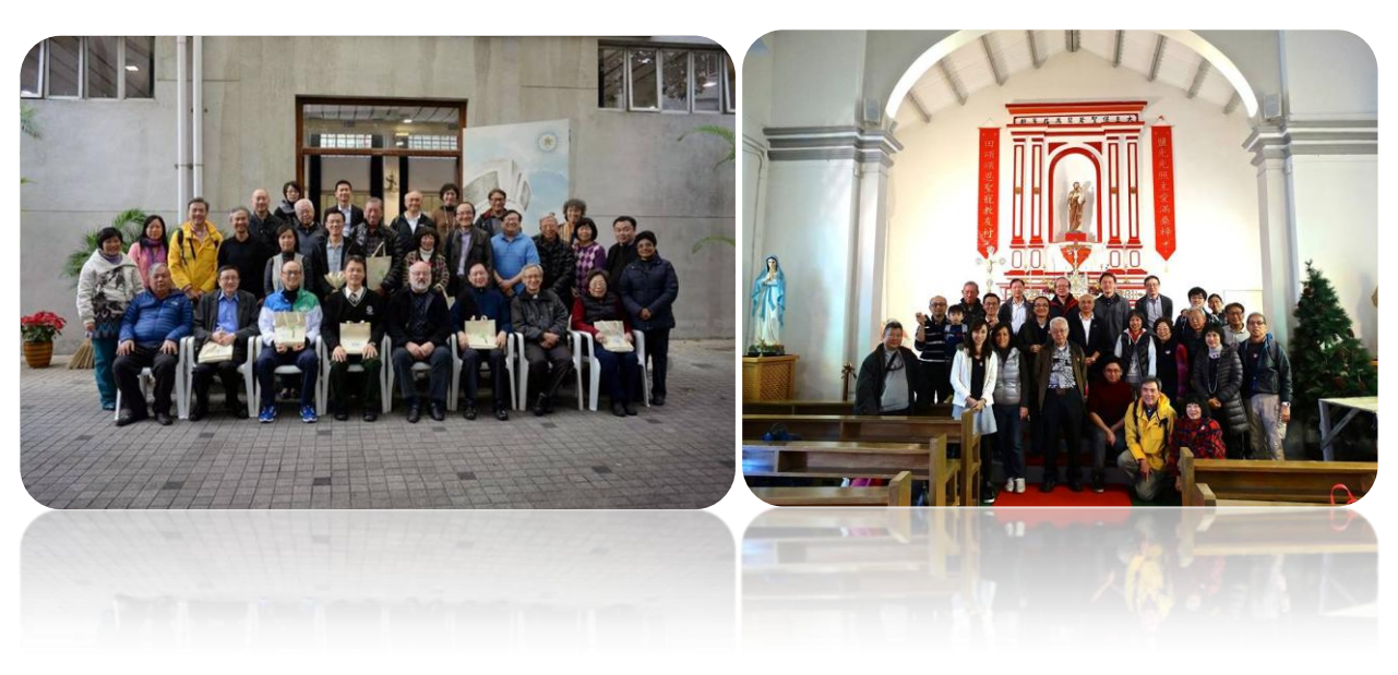
Visit to Heritage of Jesuits in Macau Day 2

The 2014 Wah Yan International Conference was held in a distinguish way this year, with a three-day event spanned across three locations instead of one single venue. The Conference set its reception in the newly renovated school hall of WYHK on 5<sup>th</sup> December with day trips to Jesuits establishments in Macau & Yim Tin Tsai on 6<sup>th</sup> & 7<sup>th</sup> respectively.