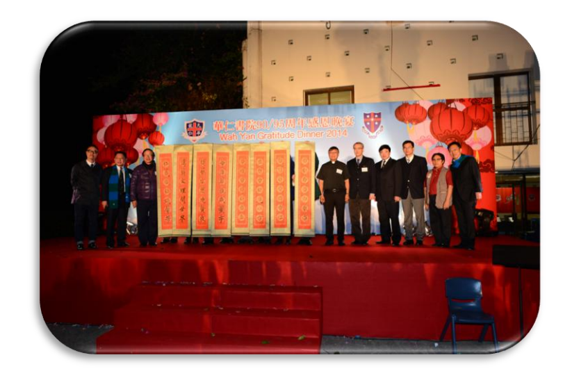
An auction was held in the dinner to raise funds for school development.