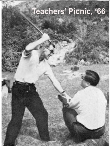
"A mosquito? — Half a mo, and I'll get it!"