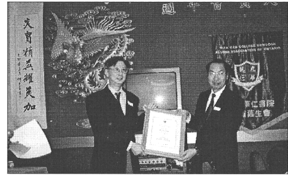
Annual General Meeting November, 2000