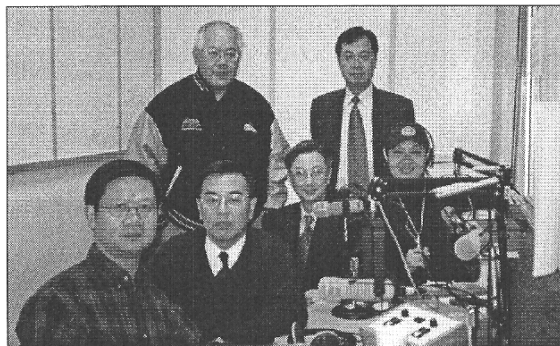
Radio Show at Toronto CCBC November, 2000