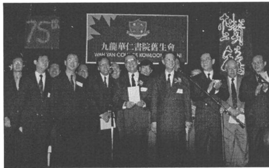
Directors at Diamond Jubilee Celebration July, 1999