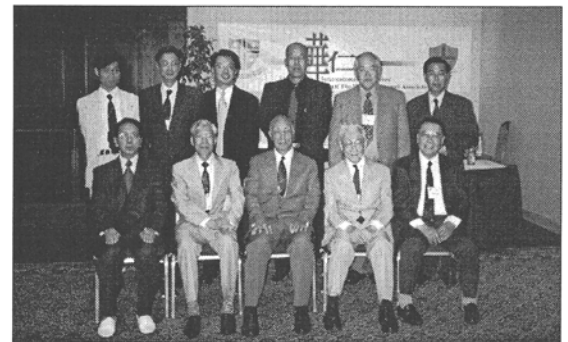
Ontario Delegates and Teachers at 7 th International Conference in Los Angeles August, 2000