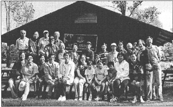
Picnic August, 2000