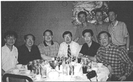
Ontario Delegates at 6 th International Conference in Calgary August, 1998