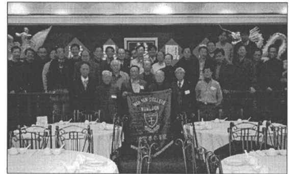
Spring Banquet March, 2000