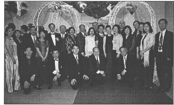
Joint Schools Valentine Ball February, 2001