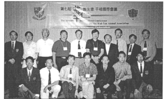
Delegates at 7 th International Conference in Los Angeles August, 2000