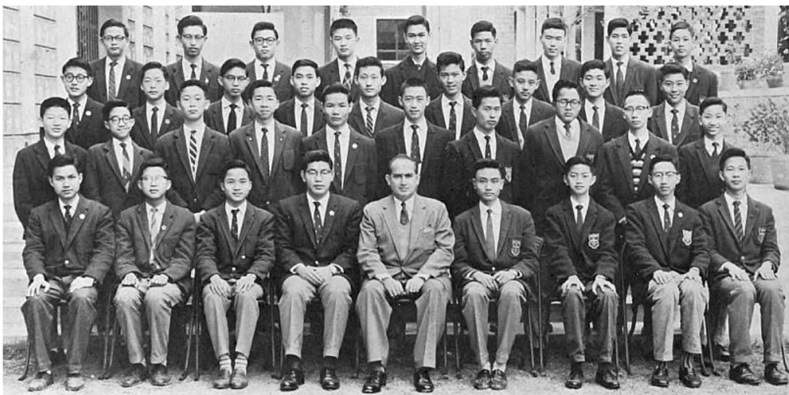
FORM 4D (59-60)

F4D 1959-1960 – 3 rd row from top - 1 st right