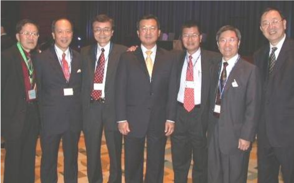
2004 – 2nd right – Wah Yan International Conference