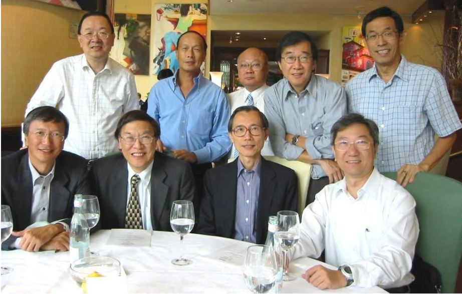
2004 –bottom row - 1 st right – ‘61 Grads HK reunion