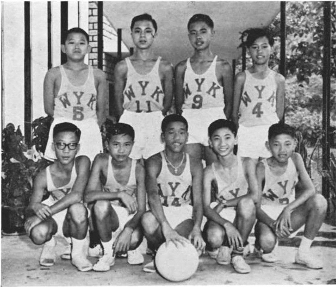
1958-1959 – bottom row – 4 th left