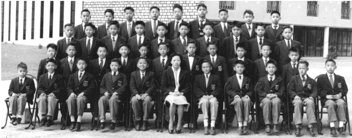
P6D 1955-1956 – 3 rd row from top - 4 th left