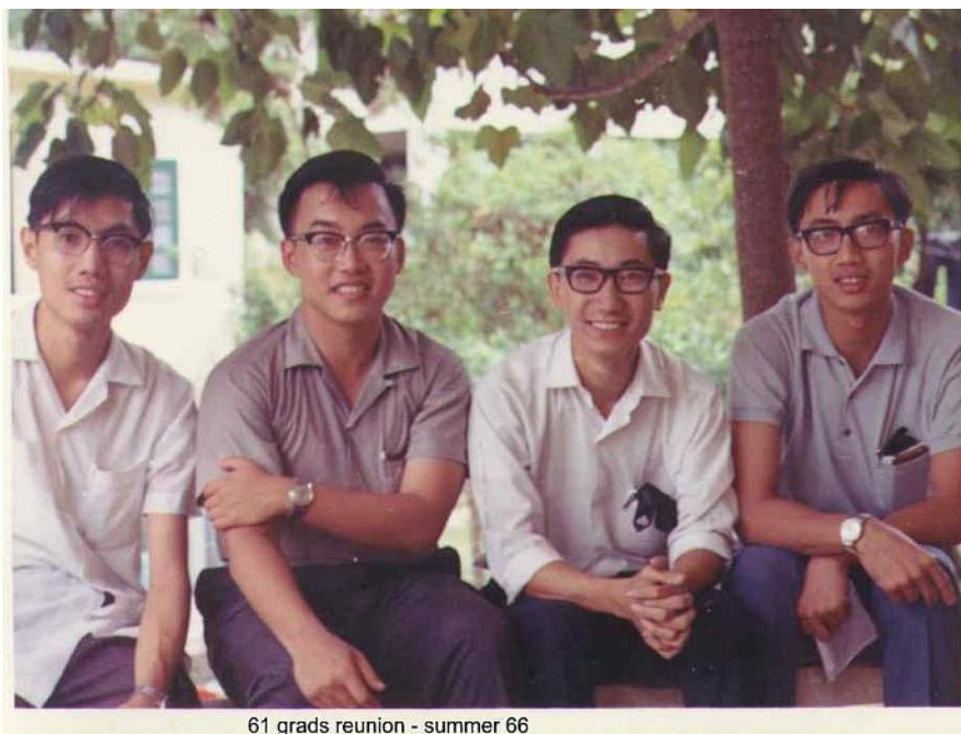
1966 – 3 rd left – ‘61 Grads summer picnic