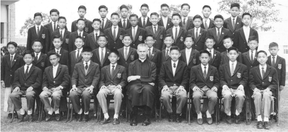
F2D 1957-1958 – 3 rd row from top - 8 th left