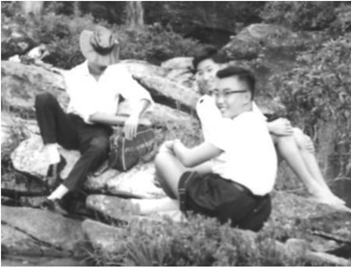
1962 -2 nd left – Class picnic