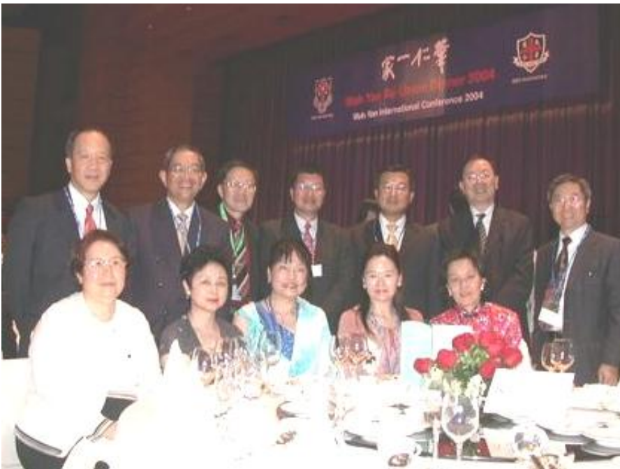
2004 – standing - 1 st right – Wah Yan International Conference