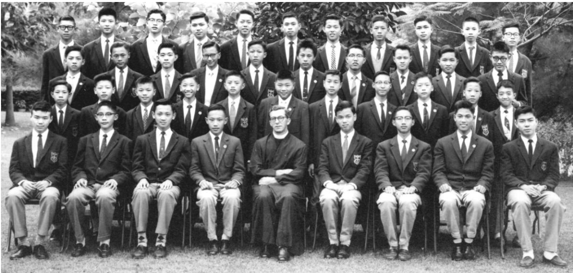
F3D 1958-1959 – 3 rd row from top - 4 th left