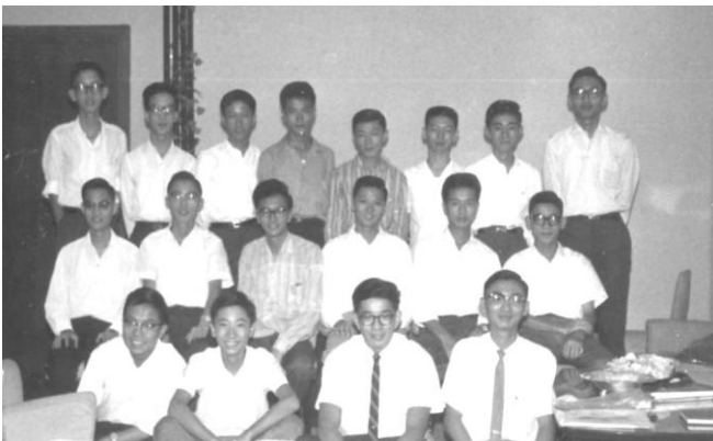
1962 –bottom row - 2 nd left – Dinner gathering with classmates