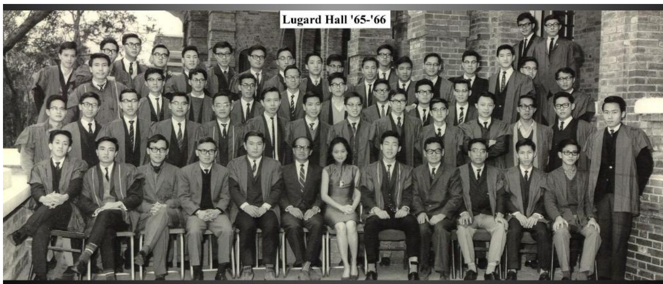
1965-1966 – Group photo, Lugard Hall, HKU – 3 rd row from top – 2 nd left