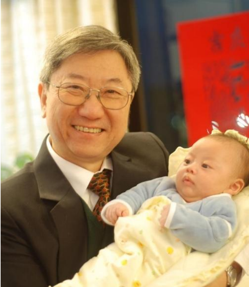
2009 – With grandson