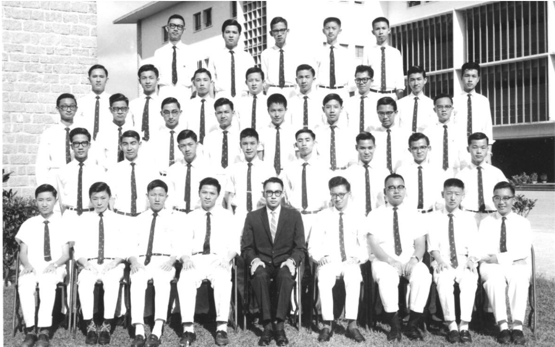
F6S 1961-1962 – bottom row – 1st left