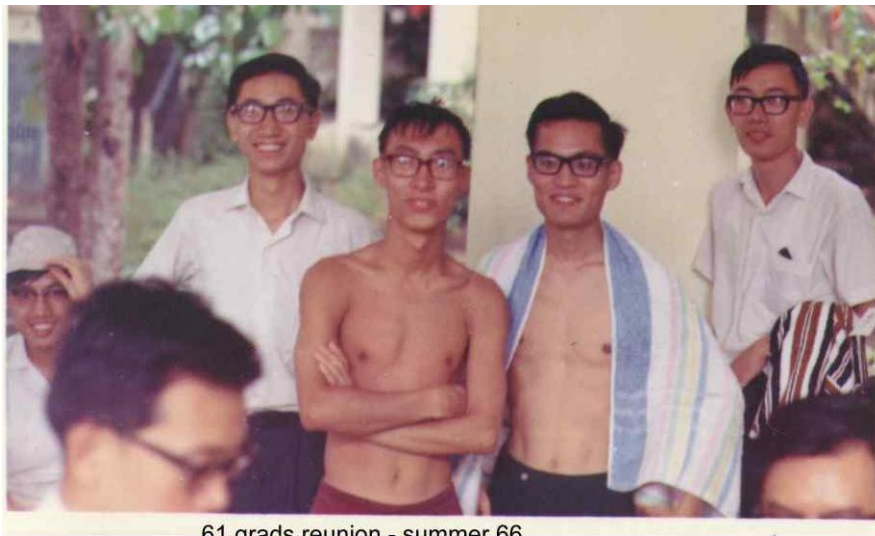
61 grads reunion - summer 66

1966 – standing - 2nd left – ‘61 Grads summer picnic