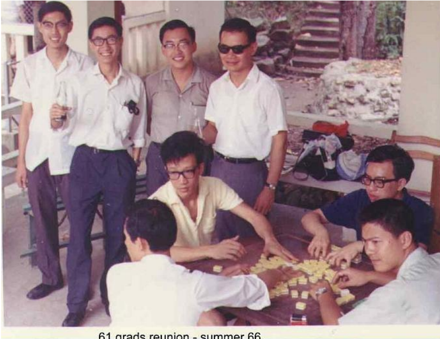
61 grads reunion - summer 66

1966 – standing - 2nd left – ‘61 Grads summer picnic