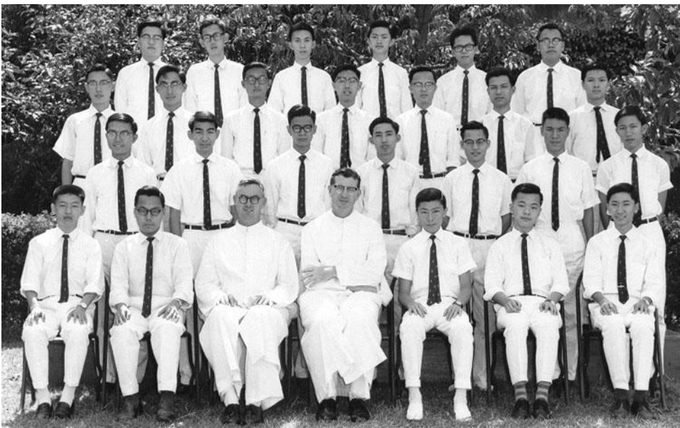
Wah Yan College Kowloon F.7 1962-63