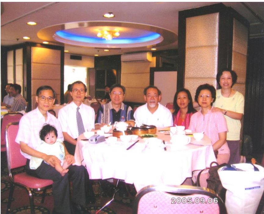
2005 – 3 rd left – Gathering with classmates