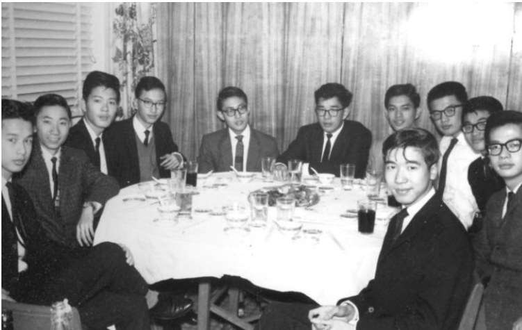
1961 - 2 nd left – Graduation dinner