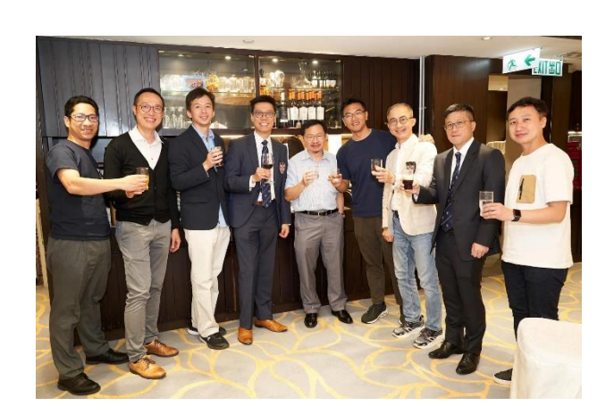
The representatives of WYKPSA joining the AGM of WYHKPSA