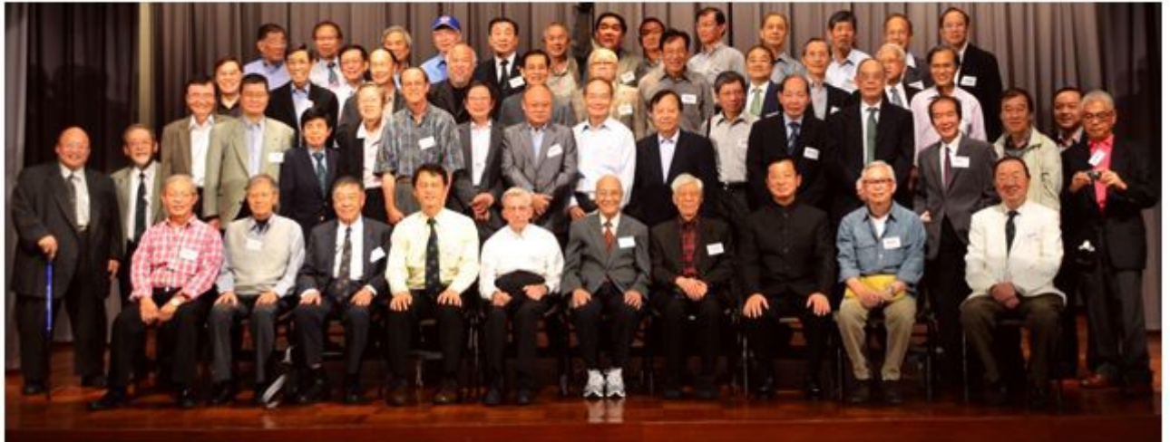
Wah Yan Kowloon '61 Grads 50th Re-union School Hall Nov. 13, 2011