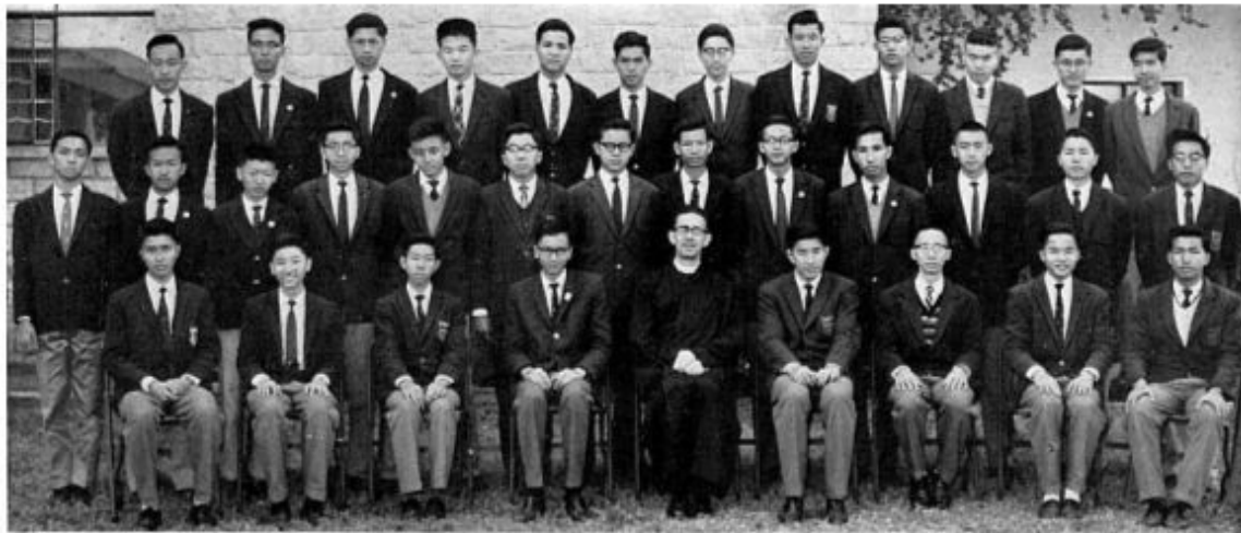
FORM 5C, 1960 - 1961