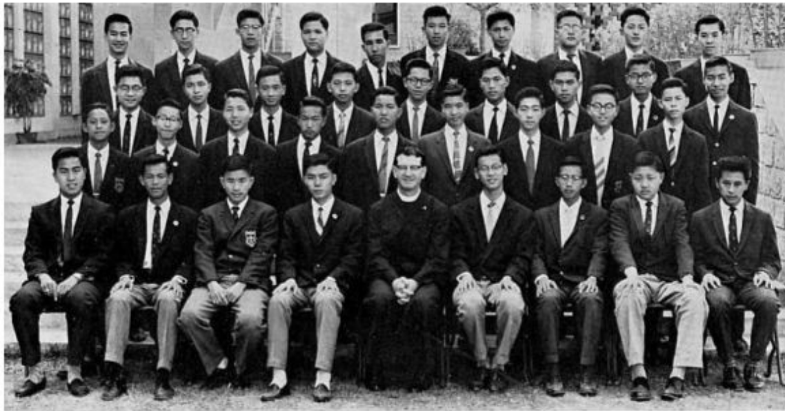
FORM 4C (59-60)